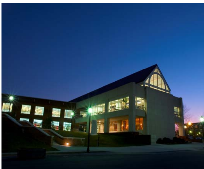
The Janet D. Greenwood Library