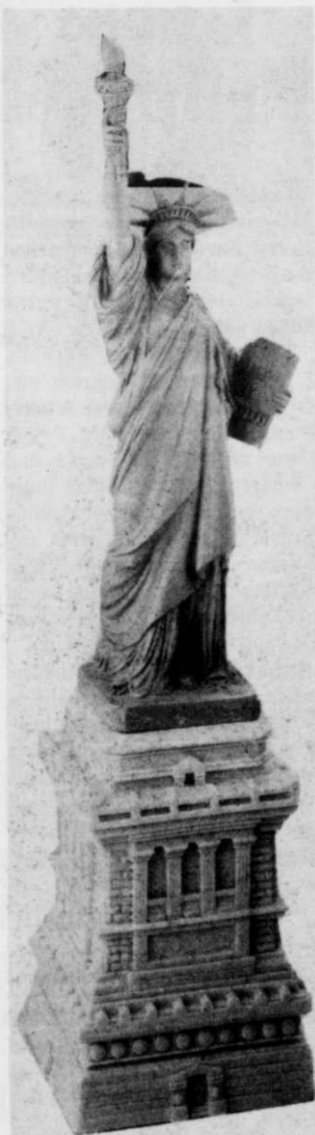
1 Centennial Commemorative Statue of Liberty. Signed, limited edition. Crafted of bonded bronze and marble in the U.S.A. Includes Certificate of Authenticity signed by Lee Iaccoca. 15" high. Gift boxed. Barrett Colea, an official licensee of The Statue of Liberty — Ellis Island Foundation will donate a percentage of the proceeds to the restoration fund. (8 lbs.) 598 01AN $50.00 ..... Your Cost $42.50 SALE $37.50

The resurrection is not merely a physical one, but also a spiritual one. The past two years have re-awakened the nation's conscience to the Statue of Liberty's deeper meaning, and