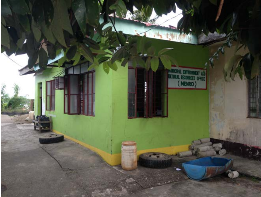
Figure 1.3. MENRO Laoang.