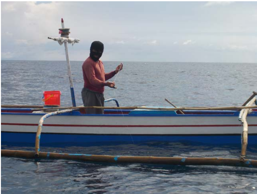
Figure 3.2. Fisherfolk at a FAD.