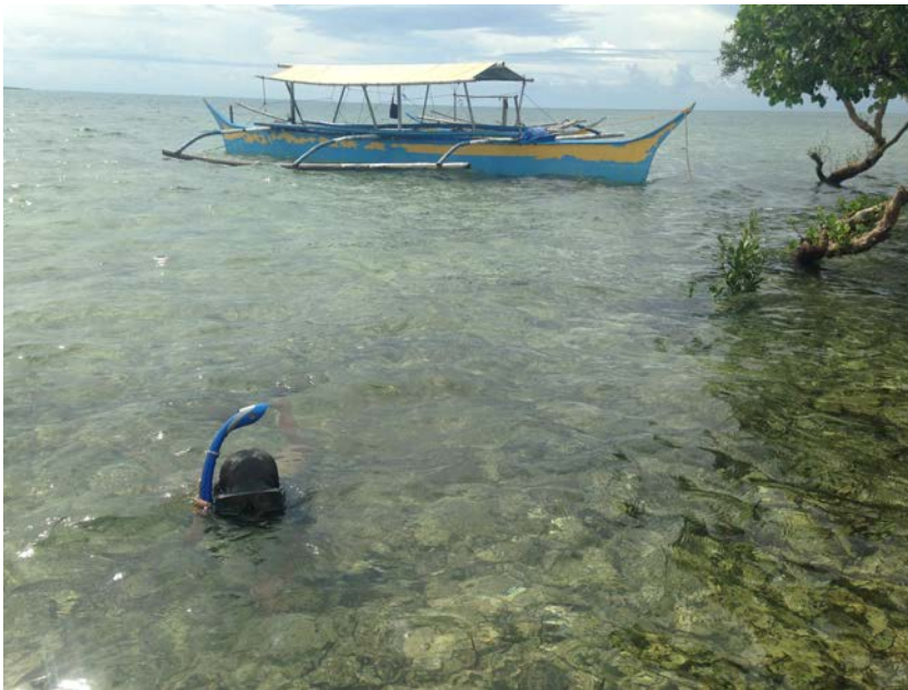
Figure 4.1. Local child explores the coastal waters of Laoang.

A relatively straightforward and inexpensive plan for promoting sustainable local fisheries would be the expansion of the current fisheries education program that is run by MENRO Laoang. There are discussions (often facilitated by MENRO Community Organizers) and presentations about the damage of illegal gear and fishing sustainably, but these are not always happening in every coastal barangay or necessarily being actively promoted in the schools. The development of an enhanced curriculum for both youth and adults about the potential for ecosystem development and the dangers of turning to illegal methods could improve sustainable resource management on a community level. Sustainable fishery development is untenable without community support. It is also important to note however, that discussion will not prevent people from fishing out of desperation.