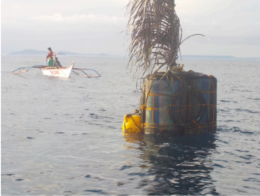
Figure 1.2.1. FAD within the municipal waters of Laoang.