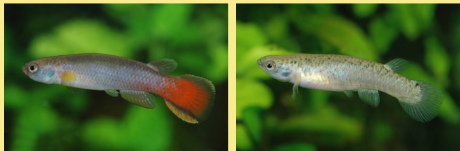
Male (above left) and female (above right) Rivulus tenuis Taco Talpa.