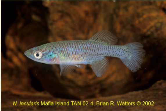
N. insularis Mafia Island TAN 02-4, Brian R. Watters © 2002