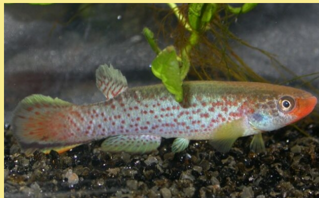
Rivulus godmani Tamarandito.