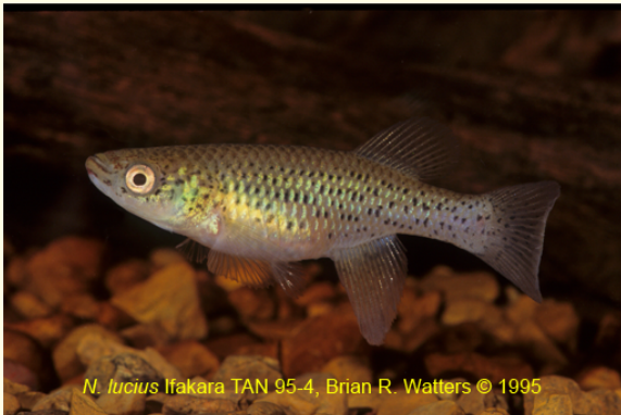
N. lucius Ifakara TAN 95-4