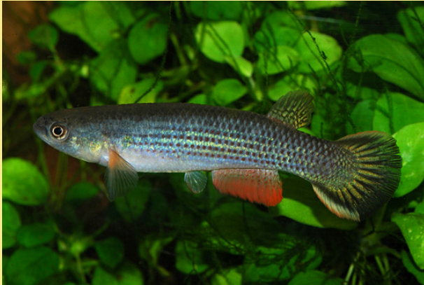
Male Rivulus hartii , Rio Copei, Isla Margarita. Photo by Frans Vermeulen ©2017.

Walsh et al. Proceedings of the Royal Society B, 283, 20161075. [Tyrone Genade]