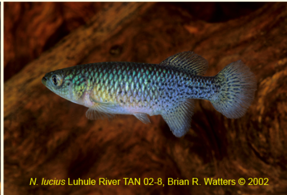
N. lucius Luhule River TAN 02-8, Brian R. Watters © 2002