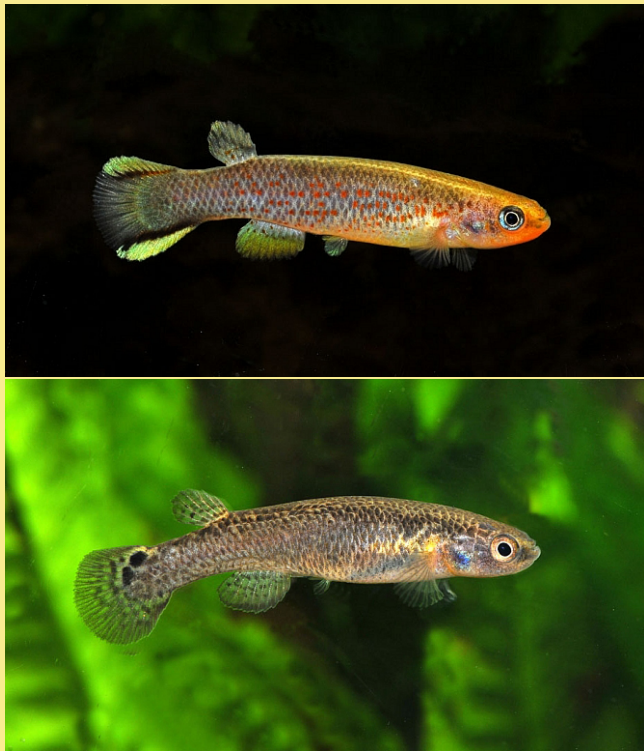
Male (above) and female (below) Rivulus degreefi Rio Oscuro, Guatemala.

Three new species of the killifish genus Melanorivulus from the central Brazilian Cerrado savanna (Cyprinodontiformes, Aplocheilidae) Costa WJM. ZooKeys , 645:51–70, 2017. DOI: https://doi.org/10.3897/zookeys.645.10920 .