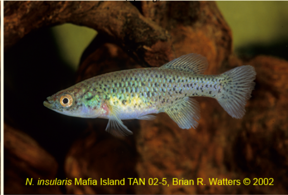
N. insularis Mafia Island TAN 02-5