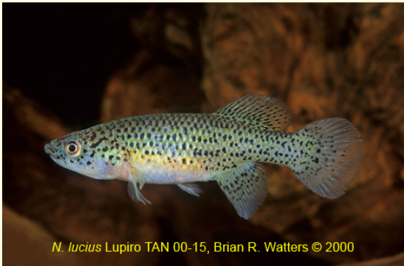
N. lucius Lupiro TAN 00-15, Brian R. Watters © 2000

An array of photos of female fish of N. insularis and lucius . The Ifakara, Lupiro and Narubungo populations are from the Kilombero Valley area; the Luhule River populations are from the coastal part of the “Mbezi Triangle”. Note the arrangement and shape of the spots on the flanks of the females. There is no evidence of a pattern of oblique rows or horizontal spots being typical of either species. Similarly there is no pattern or difference in the density of the spots in the unpaired fins. There is considerable inter- and intrapopulation variation in the pattern and color of spotting and these are probably not useful characters for separating the two species. All photos are of wild caught fish.