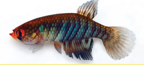
Photo of Papiliolebias habluetzeli Trinidad BP 2013-04 (top,) and Papiliolebias francescae (bottom,).