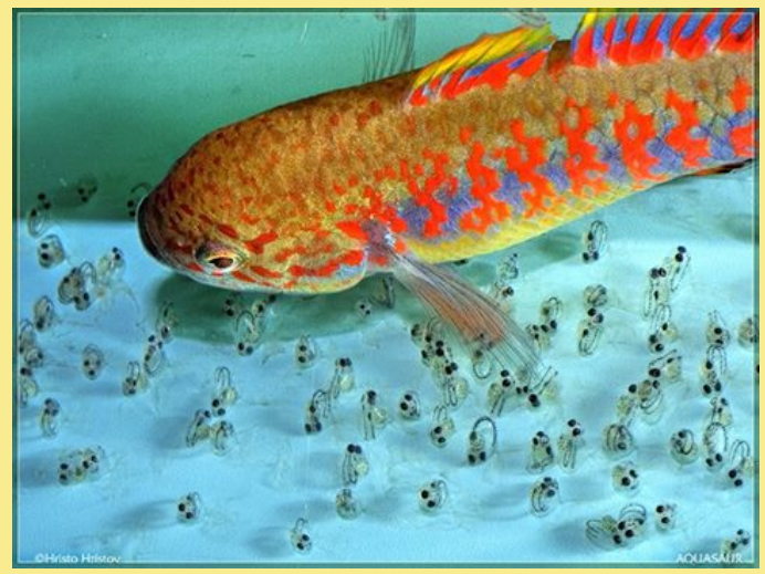
Photo of male Tateurndina ocellicauda tending its eggs. It isn't a killifish but does make a for a great photo.