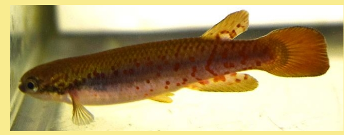
Four undescribed (or unidentified) species of Rivulus (Melanorivulus). From top to bottom: Rivulus sp, San Matías HvdB 2015-04; Rivulus sp. Nova Xavantina HvdB 2014-29, State of Mato Grosso, Brazil; Rivulus sp. Água Boa HvdB 2014-27; Rivulus sp Cocalinho HvdB 2014-24, State of Mato Grosso, Brazil.

northern limit of the range of M. wallacei and that the two species can be distinguished by the pattern of oblique rows of red dots along the flank and its orange caudal fin. A distribution map and identification key is provided. [Tyrone Genade]