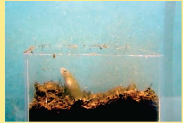
Spawning behavior of Millerichthys robustus.

but this effect vanished after 91 days. 17-\alpha -ethinylestradiol did not effect survival but treated fish began to reproduce at an earlier age. Fish exposed to the lower dose laid significantly fewer eggs than the other fish. No difference was found between the control and treatment groups for cortisol and estradiol concentration but the 120 ng/L treated fish had higher levels of testosterone (at the 91 and 168 day time