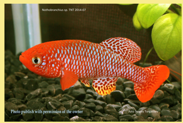
Photo of Nothobranchius streltsovi TNT 2014-07.

It was found together with N. seegersi in shallow pools without vegetation. The water is turbid from a clay suspension with pH 7.9 and 150 \mu S·cm<sup>-1</sup> conductivity. [Tyrone Genade]