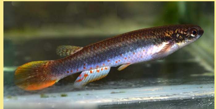
Three species of Rivulus (Melanorivulus). From top to bottom: Riv. punctatus aquarium strain from Paraguay (photo by Frans Vermeulen©); Riv. zygonectes Porto dos Gaúchos HvdB 2015-15 (photo by Jurij Phunkner©); Riv. rubromarginatus Mato Grosso HvdB 2014-23 (photo by Jurij Phunkner©).