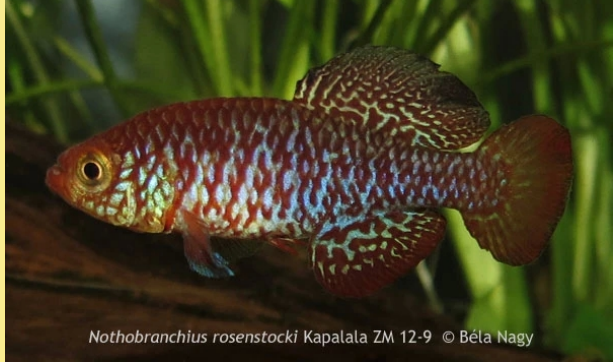
Photos of N. sainthousei, top; and N. rosenstocki, below.

Based on combination of morphometric and meristic variables, together with Principle Component Analysis and molecular phylogenetics (using the ND2 gene), sainthousei could be distinguished from the other species. N. sainthousei can be differentiated from other species of the Nothobranchius species (except rosenstocki) by having broad orange-brown scale margins on the trunk and an anal fin with orange-brown margin. It is distinguished from N. rosenstocki by having orange-brown spots in the dorsal and anal fins. The type