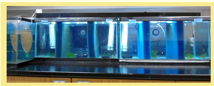
Photo of tanks connected in series on a recirculating system.

space and can be assembled at low cost. The system is at the end a tank divided in many section by foam that works as biological filter and separator. The water is pumped from last portion in one side to the opposite side (where a home made filter "cleaning" the inlet water). Many "separated" aquariums can be interconnected by PVC piping giving a very stable environment. To limit disease a UV lamp is connected to water line. The system has been proven suitable for raising and spawning Nothobranchius (for experimental purposes) because it is also adaptable to the needs and can be up- or down-scaled as needed. The author describe also his Nothobranchius spawning system, using granulated peat which is sieved to collect eggs. Fry care is also described in the context of the system. Disease and water quality management strategies are also discussed. [Stefano Valdesalici]