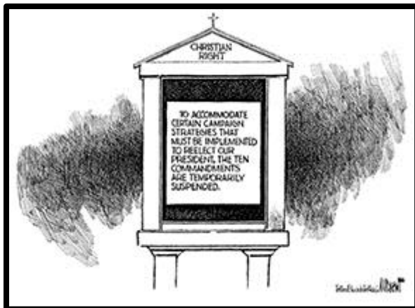
Political cartoon by Don Wright.

Please don’t misunderstand. I get why most of my fellow evangelicals—many friends as well as family members—felt their only choice when voting for president last November was between the proverbial lesser of two evils; that, however, does not excuse the largely unreserved support for or defense of Trump by many of those same voters a year later, does it? A less than flattering view of evangelical Christians, of course, predates this curious relationship with the current president. Consider the message—both explicit and implicit—in the drawings depicted by two-time Pulitzer Prize winning editorial cartoonists Don Wright and David Horsey (one of my all-time favorite artist-commentators):