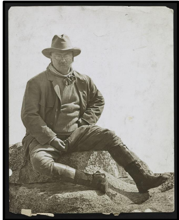
Theodore Roosevelt at Glacier Point, CA.

Because he occupied so many roles, pursued so many hobbies, and had a seemingly unquenchable curiosity, Theodore Roosevelt, the twenty-sixth President of the United States, has provided much fodder for historians in the