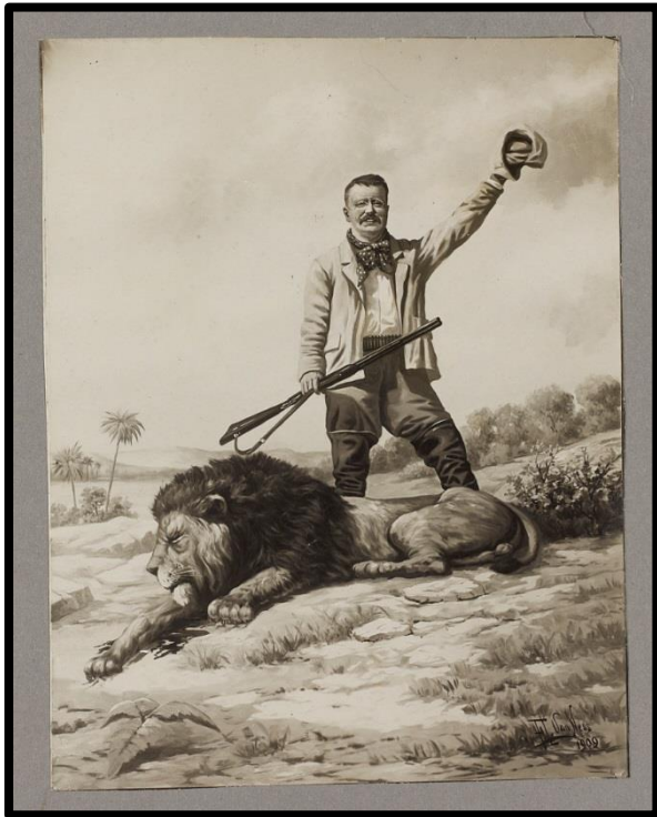
Theodore Roosevelt with dead lion.

One of the nation’s finest tributes to Roosevelt the naturalist, conservationist, and explorer can be found within the walls of New York’s American Museum of Natural History.