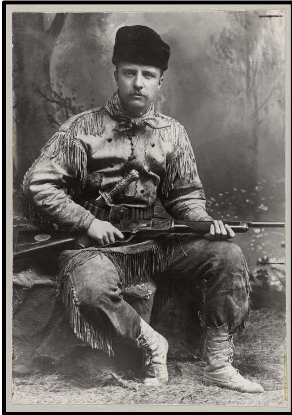
Theodore Roosevelt, 1885.

With the choice of Theodore Roosevelt: Hunter-Conservationist (Boone and Crockett