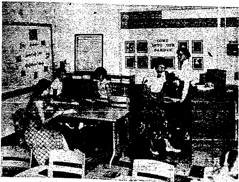
... A Corner In The Curriculum Laboratory. Where Future Teachers Are Introduced To Modern, Effective Teaching Aids