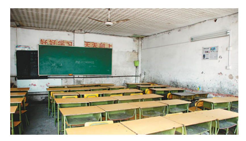
Picture 3. Beijing Migrant children school, Lv Yuan Migrant Children School<sup>13</sup>

migrant children schools are not required to have local household registration. The classes, however, are normally held in a private house or abandoned factories (Picture 3&4). Attending migrant children school is always the easiest way for migrant children to receive an education. Yet is a migrant children school the best choice for migrant children?