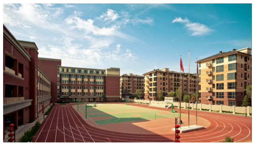
Picture 1. Beijing public school, The Elementary School Affiliated to Renmin University<sup>10</sup>