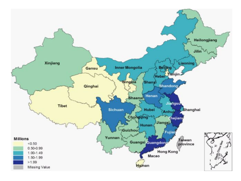
Figure 1. Number of Migrant Children by Province, 2010 21

In order to provide the most holistic, accurate assessment of these four places, we must take a closer look at the numbers. On the whole, how many migrant children does China have? The data from the Sixth National Population Census of China showed that in 2010, China had 35.81 million migrant children age between 0 years and 17 years, which increased by 41.37% from 2005 and the number of migrant children continues to grow. <sup>19</sup> Of these migrant children, 80.35% of them hold agricultural household registration. Accordingly, China has 28.77 million rural migrant children. <sup>20</sup>