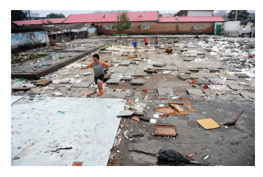
Picture 4. Migrant Children running through the trash after the demolition of migrant children school<sup>14</sup>