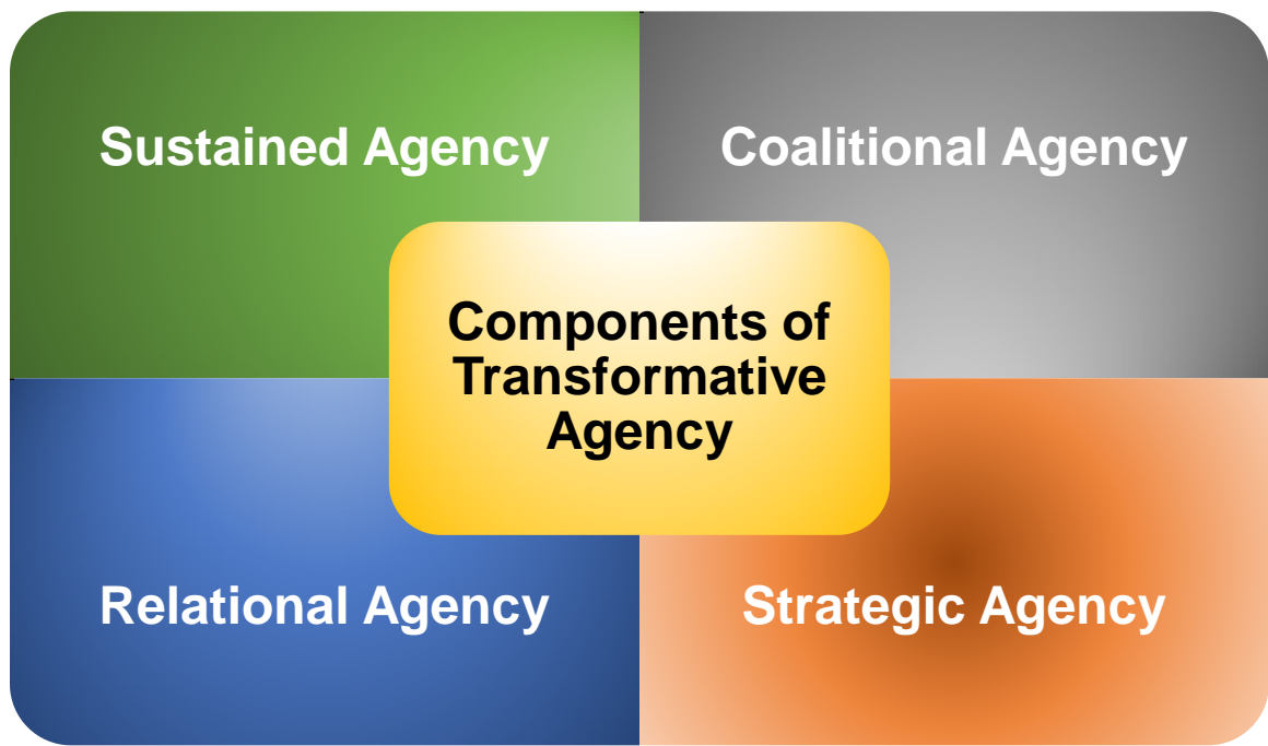
Figure 2: Core Components of Transformative Agency

may not always be simple ways for marginalized youth to “navigate plural, intersecting structures of power, including, for example, neoliberal economic change, governmental disciplinary regimes, and global hierarchies of educational capital” (Jeffrey, 2012, p. 246); however, the undertaking of strategic and deliberate analyses of future action is a core component of transformative agency as illustrated in Figure 2 along with the other three dimensions.