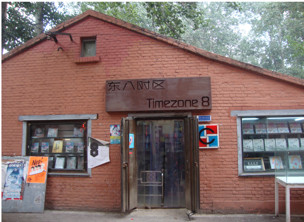
Lucy Keany, 2011, Time Zone 8, Beijing: Three Shadows Photography Centre, https://slpresearch.wordpress.com/2011/09/09/beijing-798-photo-gallery/ citation correction needed.