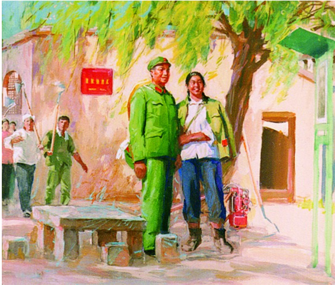
Zhilin Jin, 1977, High Ranking Cadre and daughter”, http://kennedy.byu.edu/art-politics-in-maos-china/

The work of Jin is not only a model during the Cultural Revolution but also directly connected to the lives of the masses. This very fact represent a huge transformation of Chinese Art. Even though he was forced to adapt to promote the political agenda of Chinese government during his youth, Jin utilized elements of folk art during later in his life. In Jin’s words, “art should serve the people—the workers, peasants, and soldiers, I fell in love with those paintings instantly, especially to feel such a strong folk style, and its down-to-earth, local artistic style.” 9 These words of Jin Zhilin illustrate how the minds of artists work. Despite these good intentions, all paintings had to cater to political agendas during the 1940s-1970s. They are required on art work by selecting subjects. In these historical circumstance, Chairman Mao said, “There is in fact no such thing as art