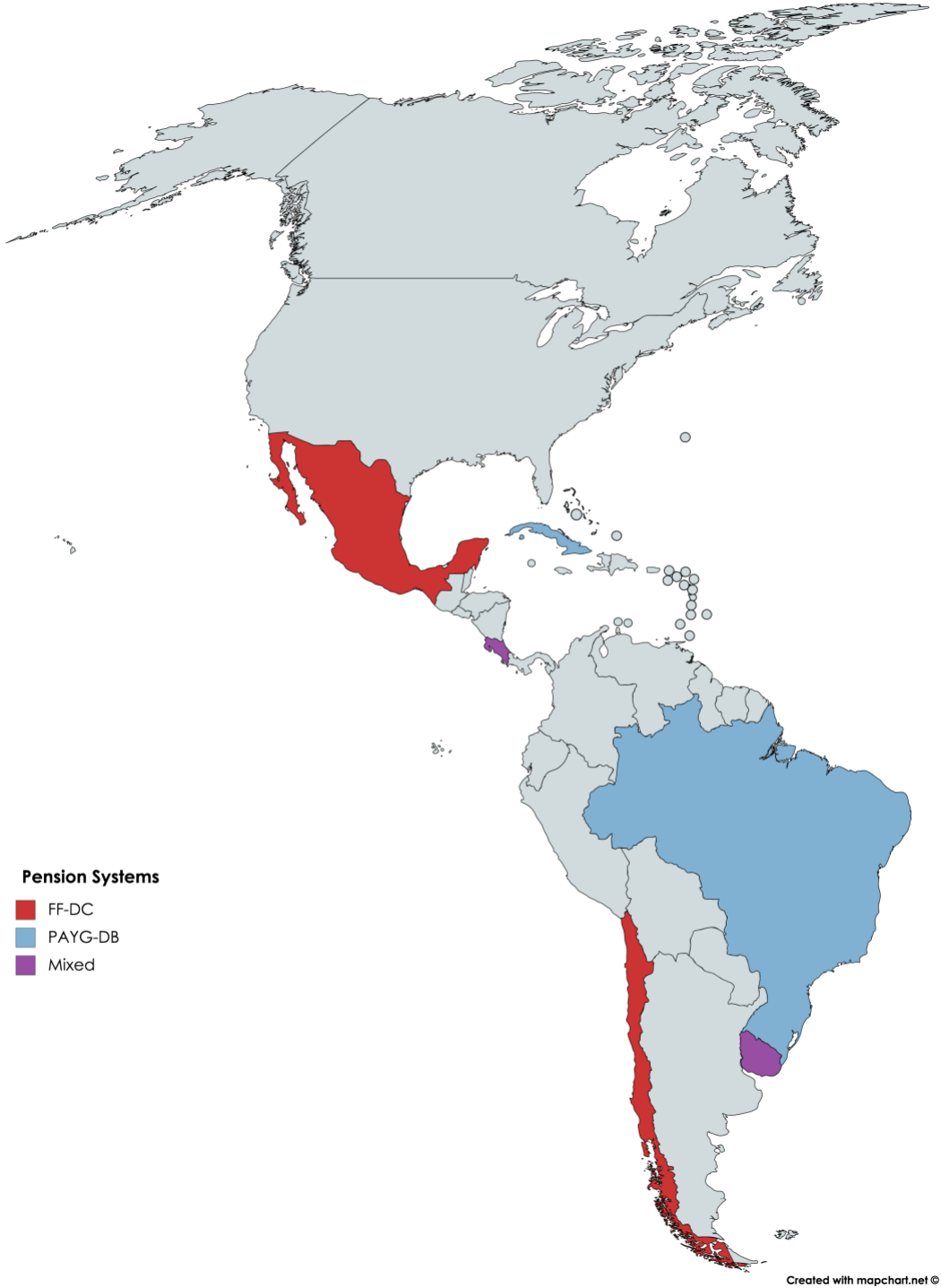
Figure 1: Pension systems in Latin America

other desired reform can ignore some of the problems that exist, and this desire can help predict future policy.