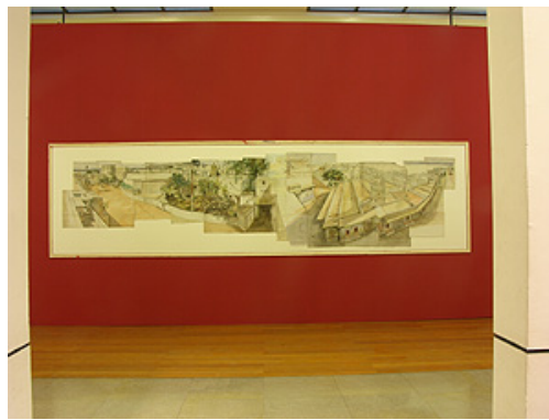
Figure 2, Installation of 23 studies for the Panorama of the Siege of Algiers , 1832, pencil and watercolor on paper, each 48.8 x 33.5 cm. Caen, private collection and Beaumont-en-Auge, Musée Laplace. [larger image]

Thus prepared by the introduction, the visitor turns to see what is unquestionably the most impressive single work in the exhibition (fig. 2), a set of twenty-three large-scale pencil drawings, made with a camera obscura , and overlaid with watercolor, that combine to produce a panoramic image of The Siege of Algiers , the subject of Langlois's second panorama (1833). These images have been brought together for the first time from two separate collections, and more than anything else in the exhibition, provide a sense of the scale of a panoramic image, even though they are placed on a large flat wall. These are beautiful drawings individually, but when they are all seen together they provide a surprising sense of what the panorama must have been like for viewers of individual works of art. The whole is indeed greater than the sum of its parts, and the sense of an entire visual experience, as opposed to a discreet aesthetic one, is palpable.