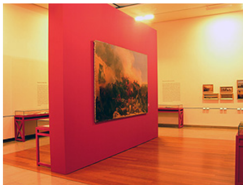
Figure 3, Installation view. [larger image]

The next room is devoted to the Panorama of the Battle of Eylau (1843) and the Panorama of the Battle of the Pyramids (1851)—both returning again to the Napoleonic period. The area devoted to this Egyptian sojourn and panorama project is one of the most spectacular (fig. 3). Here again, history painting is mixed with small studies done on site and larger panels prefiguring the panorama. There are also some photographs that belonged to Langlois, but were in fact taken by Félix Teynard and Maxime Du Camp. It was the chance encounter in Egypt between Monsieur and Madame Langlois and Du Camp and Gustave Flaubert, which opened Langlois's eyes to the possibilities of photographing sites and using the images for later compositions.