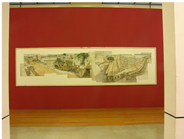
Figure 2, Installation of 23 studies for the Panorama of the Siege of Algiers , 1832, pencil and watercolor on paper, each 48.8 x 33.5 cm. Caen, private collection and Beaumont-en-Auge, Musée Laplace. [return to text]