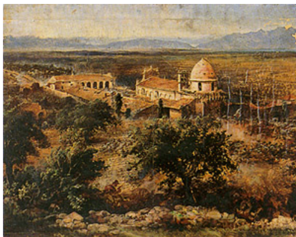
Figure 7, The Chateau and the Cemetery of Solferino , 1862, oil paint on two photographic prints, 42.9 x 44.5 cm. Caen, private collection. [return to text]