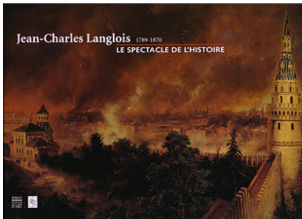
Figure 1, Cover of the catalogue [return to text]