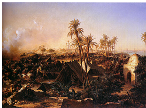
Figure 4, Maquette of the Panorama of the Battle of the Pyramids. Le Camp de Mourad (detail), c. 1852, oil on canvas, 132 x 195 cm. Caen, Musée des Beaux-Arts, inv. 2005.1.27. [larger image]

appearance and the rough slabs of wood that composed the platform and viewing deck were in clear contrast. Because the panorama section was wedged into the exhibition, the panoramic image was entirely too close. Descending, I felt that I had missed something but, at a distance, I think I get the joke. The exhibition is composed of historical fragments, so why not add an architectural fragment at the center of the exhibition. The intention was perhaps to draw the viewer in, to make him or her feel a part of the action, rather than seeing it at a distance. In this room, the practical impossibilities of historical reconstruction were made clear. Since Langlois made panorama rotundas larger and narrower, his works would actually have separated viewers from the image, but no museum I know of could have fit such a panorama in their exhibition halls. Ironically, the architectural frame, Langlois's last panorama rotunda designed by Gabriel Davioud and built on the Champs-Élysées, is the one real historical object that survives of the panoramas themselves.