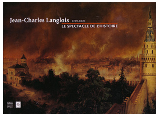
Figure 1, Cover of the catalogue [larger image]

This monographic exhibition devoted to Jean Charles Langlois, a relatively unknown nineteenth-century French painter and panoramist, is not a typical ramble through the career development of an artist whose place in the history of art is secure (fig. 1). Rather, it is an exceptional exploration of an artist who saw himself as both a painter and an author of history. Prefiguring a master such as filmmaker Sergei Eisenstein, Langlois' goal was no less than to visualize contemporary history. Colonel Langlois, as he was most commonly known, represented, in the grandest form available to him, the epic events of his lifetime—from the battles of Napoleon in Egypt and Moscow, to those of his nephew, Napoleon III, in Crimea and at Solferino. Langlois's achievement was to take a dying form of popular entertainment and turn it into a new means for projecting French military history. The descendants of this cultural form continue to flourish today, in cinemas, IMAX theaters, and videogames.