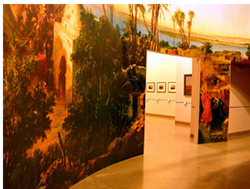
Figure 5, Installation view. [larger image]