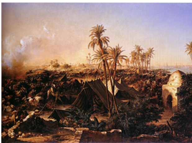
Figure 4, Maquette of the Panorama of the Battle of the Pyramids. Le Camp de Mourad (detail), c. 1852, oil on canvas, 132 x 195 cm. Caen, Musée des Beaux-Arts, inv. 2005.1.27. [return to text]