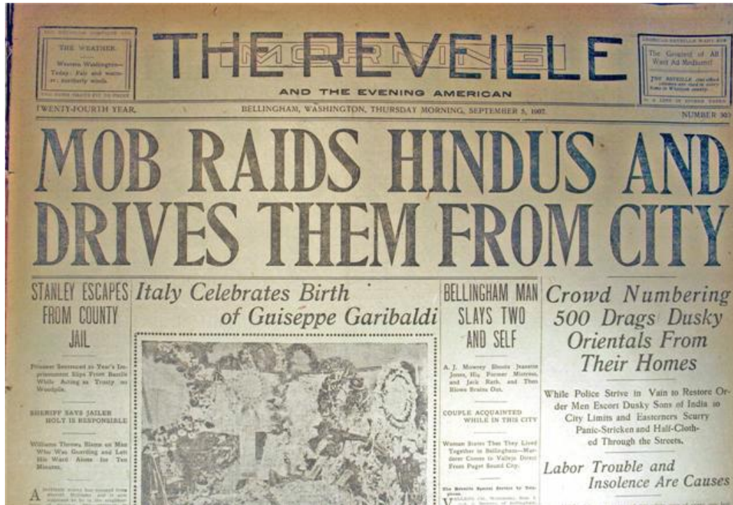
Figure 3: Newspaper Article from September 1907 on Bellingham Riots

After analyzing the newspaper image and editorial from 1907, lesson six asks students to explore present-day examples of cyber-bullying drawing on the historical information, definitional understandings of Islamophobia and xenophobia and information about what being an ally means.