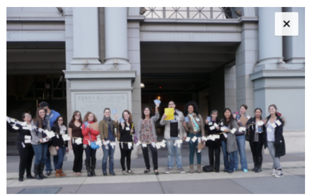
Human Rights