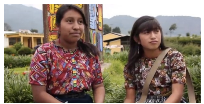
Gender Equity/Girls' Empowerment