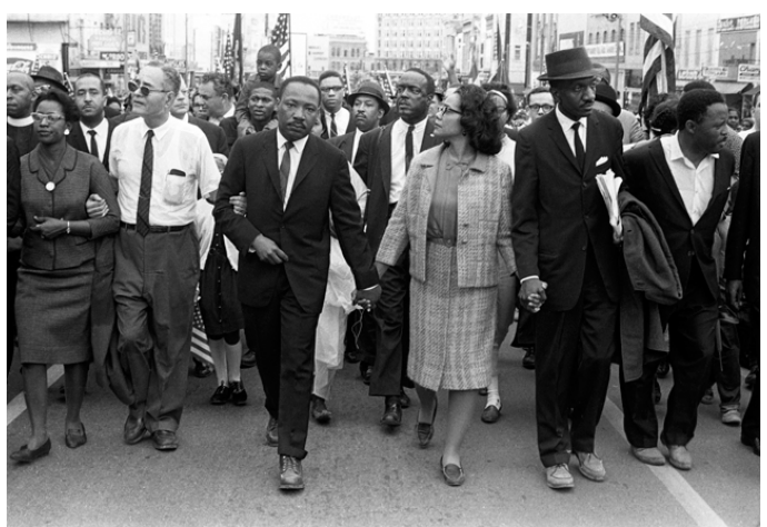
Empowerment & Human Rights