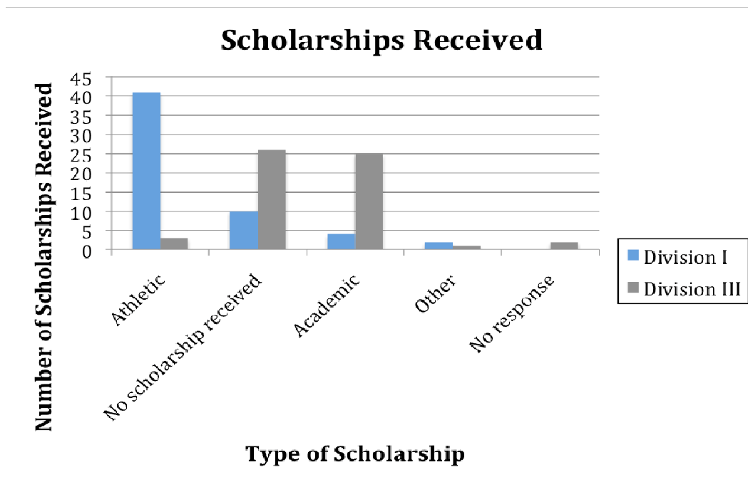
Figure 3: Summary of the type of collegiate scholarships received by the athletes.

Receiving a college scholarship is quite a significant motivating factor for specialization. A graph of scholarships received by the players in this study can be seen below (Figure 3). Athletic scholarships were only available to Division I players, but academic scholarships were available to both.