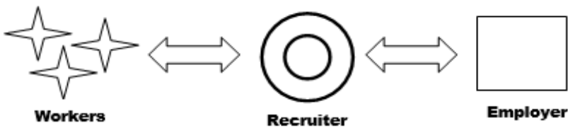
Figure 1: The Basic Recruiter-Employer Relationship

Although the core action of recruitment is captured in this simple diagram, the process of delivering people in one country to work in another often involves a chain of subcontracting arrangements. 125 As shown in Figure 2, a principal recruitment firm—which may be located in the destination or origin country, or both—may manage a network of sub-agents who stretch its