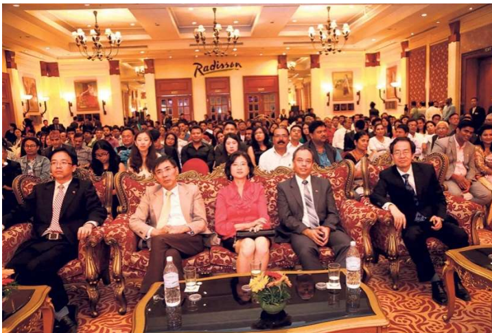
Figure 3. Awards to Chinese scholarship recipients (2017, August 28)

The extent of importance given by the Chinese ambassador to a president of an alumni association can be shown from the photograph below at an awarding ceremony of the Chinese government scholarship where the president is seated in the front row, next to the ambassador. Such gestures are apparently intended to build up goodwill for China.