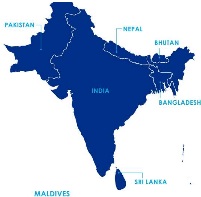
Figure 1. Map of South Asia (International Mission Board, 2016)

South Asia, with a population of 1.67 billion, is constituted of seven countries — Bangladesh, Bhutan, India, Nepal, Pakistan, Maldives and Sri Lanka 1 — the last two of which are littoral states. India is the largest among them by size, population and economy.