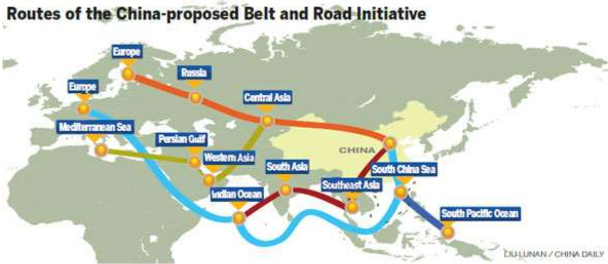
Figure 4. China’s BRI Program (Jia, 2015)

and Martel (2017) describe it as a “super-highway for Chinese economic dominance”; they write, “[It] is China’s plan to dominate world trade by building and controlling a network of roads, pipelines, railways, ports, and power plants to deliver raw materials to China and finished goods to the rest of the world” (para.5). In May 2017, Nepal signed a Memorandum of understanding (MoU) with China, agreeing to join the BRI.