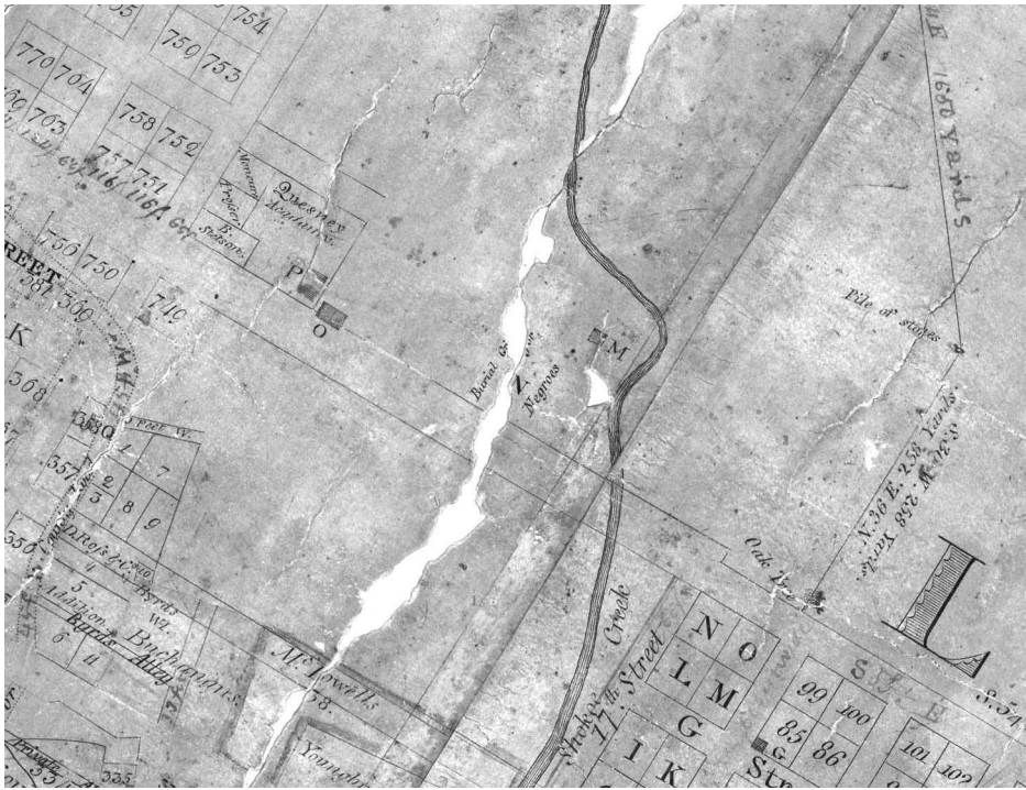
Figure 1. Partial image of Richard Young's map, Plan of the City of Richmond (c. 1809), showing the Burial Ground for Negroes and surrounding area. The image's upper edge faces northward.

in Richmond,” and Richmond was second only to New Orleans in volume of slave trade activity. 26 Fifty slave traders and nearly all of Richmond's slave auction houses operated in Shockoe Bottom. 27 The concentration of activity was such that the area became a tourist stop for visitors curious to see the inner workings of the slave trade. 28 Slaves were “employed” throughout the neighborhood as well as traded: the James River was crucial to the city's lucrative tobacco industry, which by the mid-1800s relied on captive labor not just for growing and harvesting tobacco, but also for processing, packing, and shipping tobacco from factories and warehouses located near the river. 29