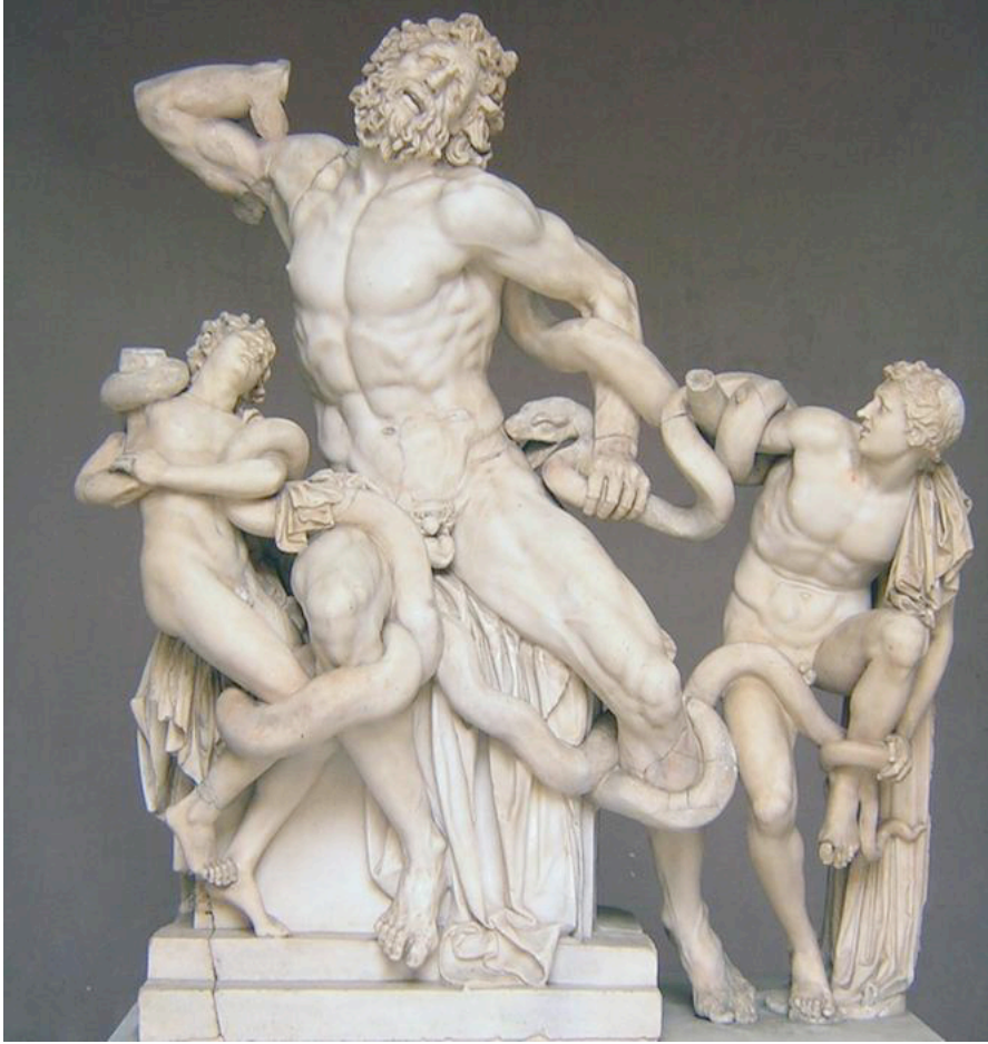
Illustration 1. Laocoon and His Sons . Year unknown

mind, however, that the motion in this scene is suspended, harking back to the effect of Laocoon's statue.