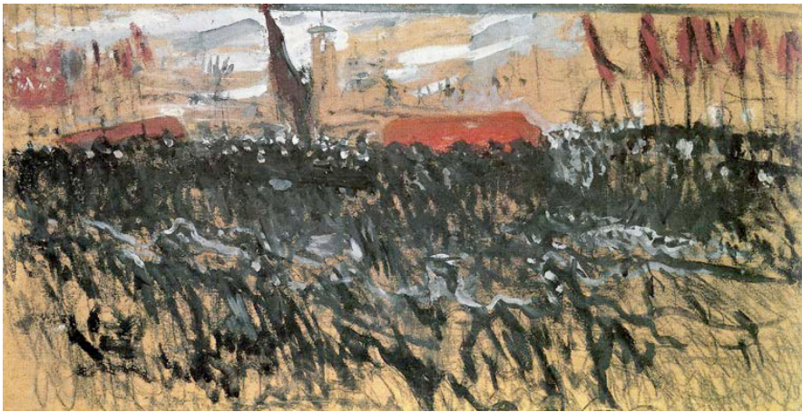
Illustration 2. Pochorony Baumana (1905). Valentin Serov (Cat. No. 468)

A tremendous amount of sketches and postcards circulated in the capital cities in the years of 1905-1907. 11 According to Pasternak, his father also left some sketches of the events of 1905: "among my father's papers are some sketches he made at the time: a woman agitator, who was making a speech on the balcony, is being shot at by dragoons [...]" ( I Remember ; 1959: 47). Pasternak must have been familiar with Serov's painting of 1905 that deals with the subject by the same name, Devjat'sot pjatyj god (as well as Serov's other works depicting events of 1905, such as Soldatuški, bravy rebjatuški, gde že vaša slava? and 1905 g. Posle usmirenija ). Some descriptions in Pasternak's poema are generally reminiscent of the sketchy motion captured in these works by Serov. Moreover, several passages contain suggestions of the ekphrastic.