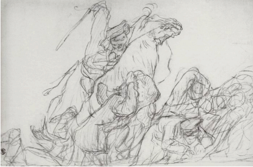
Illustration 4. Razgon kazakami demonstrantov v 1905 godu (1905) (Cat. No. 485)

(Hell steams in the background. / [...] / Yet the road is steaming, / And out of the whirlwind / Appear Cossacks on horses. / [...] / Presnja spread itself flat, [...] / With a whirl of women's kerchiefs / It washed / The protrusions of mounted horsemen / And handed over / To its suppressors / Browning machine guns on bedsheets.)