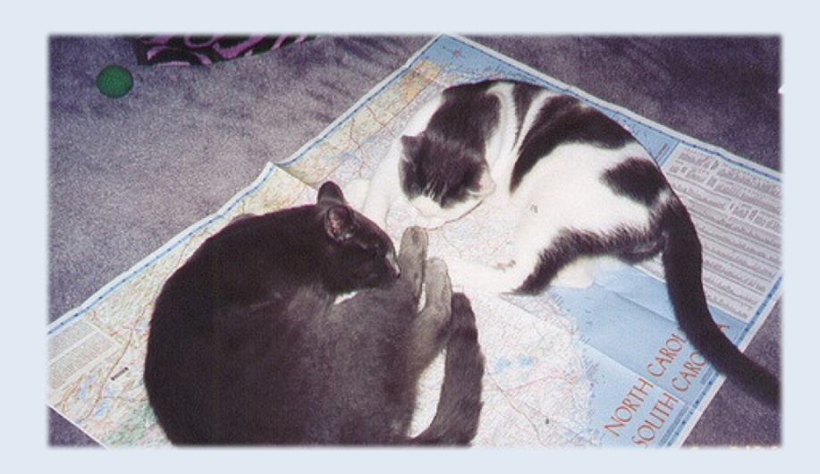
Image description: Cicero and Seneca use an image of the Carolinas to plan their next outing—or to take a nap—whichever comes first.

http://digitalcommons.kent.edu/ugresearch/2015/English_Comm/1/Gallery: http://digitalcommons.kent.edu/ugresearch_gallery/