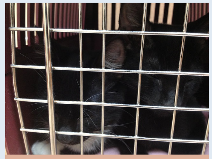
Image description: The Astrophysikitties show how two different types can sit together in the same container.

Oregon Wine History Archive hosted by Linfield College uses a combination of communities, image galleries, and series: http://digitalcommons.linfield.edu/owha/