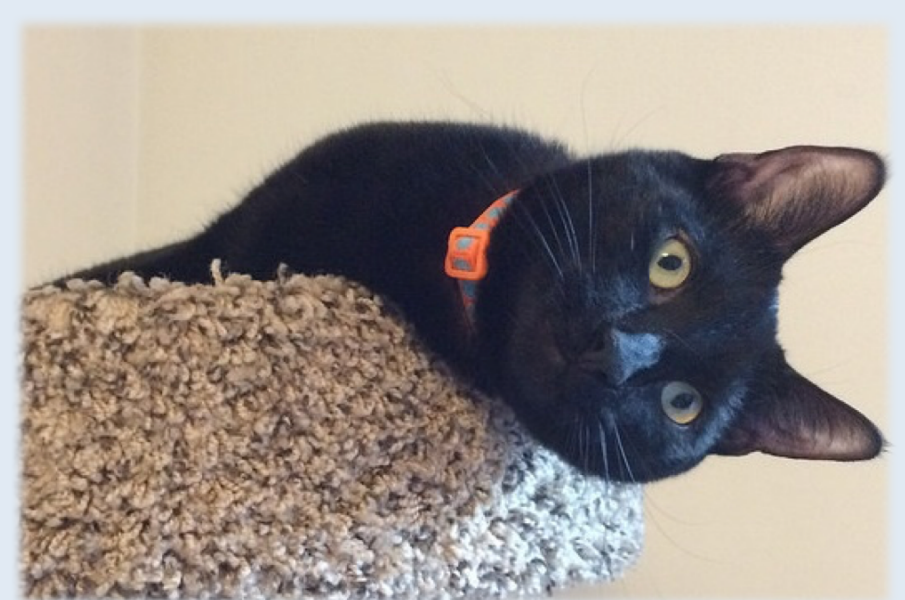
Image description: Sagan, one of the Astrophysikitties, demonstrates how sometimes you have to be willing to view things from a new angle.