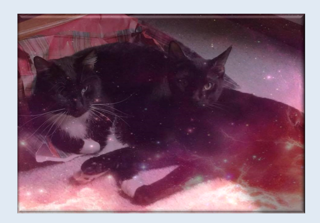
Image description: Tyson and Sagan, the Astrophysikitties, know how important data can be in scientific research.