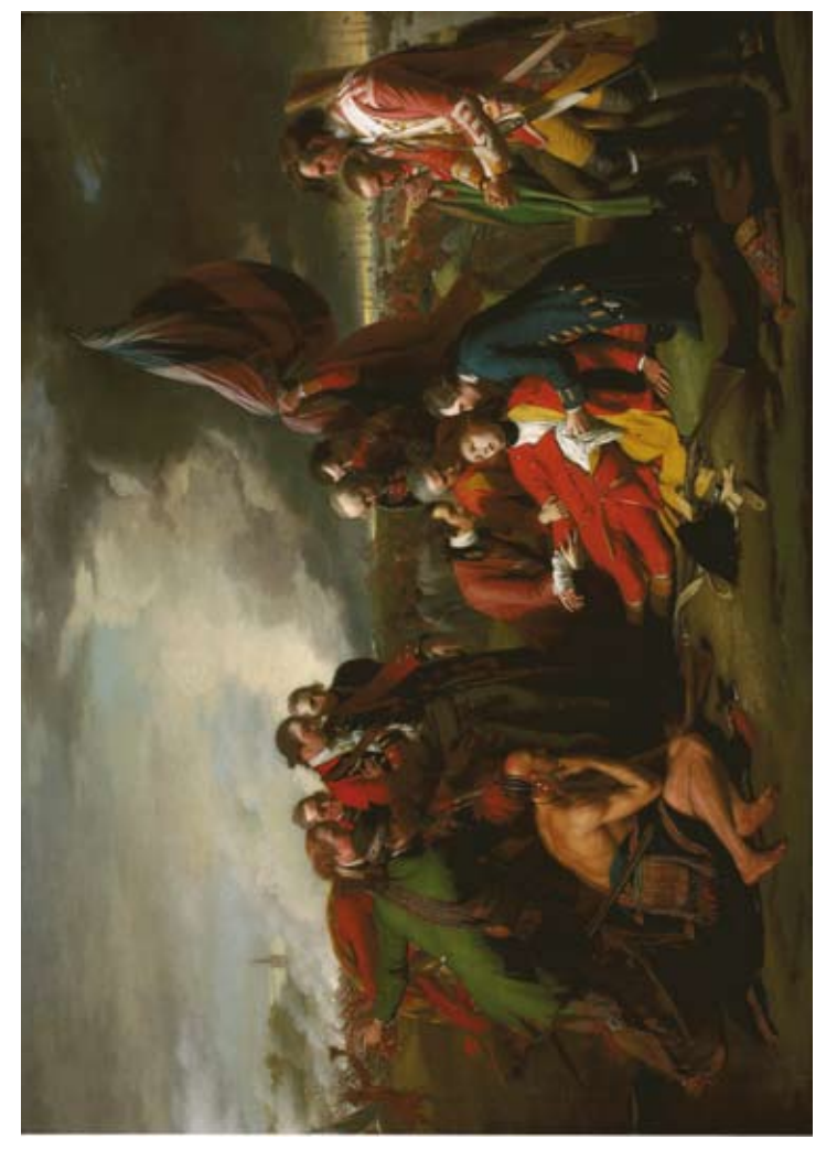
Figure 2. Benjamin West, The Death of General Wolfe , 1770. Oil on canvas, 152.6 x 214.5 cm. National Gallery of Canada (no. 8007).