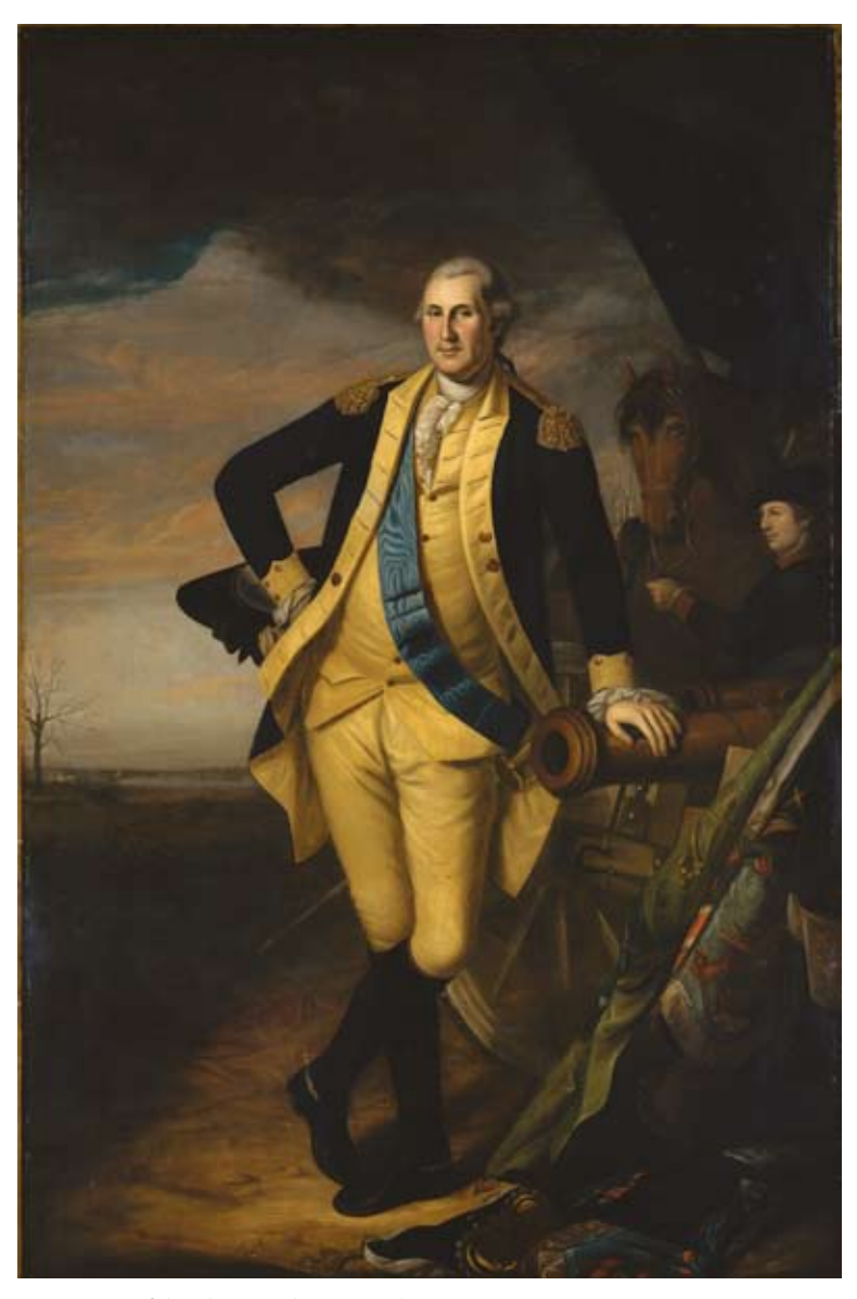
Figure 1. Charles Wilson Peale, George Washington , ca. 1779-81. Oil on canvas, 241.3 x 156.8 cm. The Metropolitan Museum of Art, Gift of Collis P. Huntington, 1897.