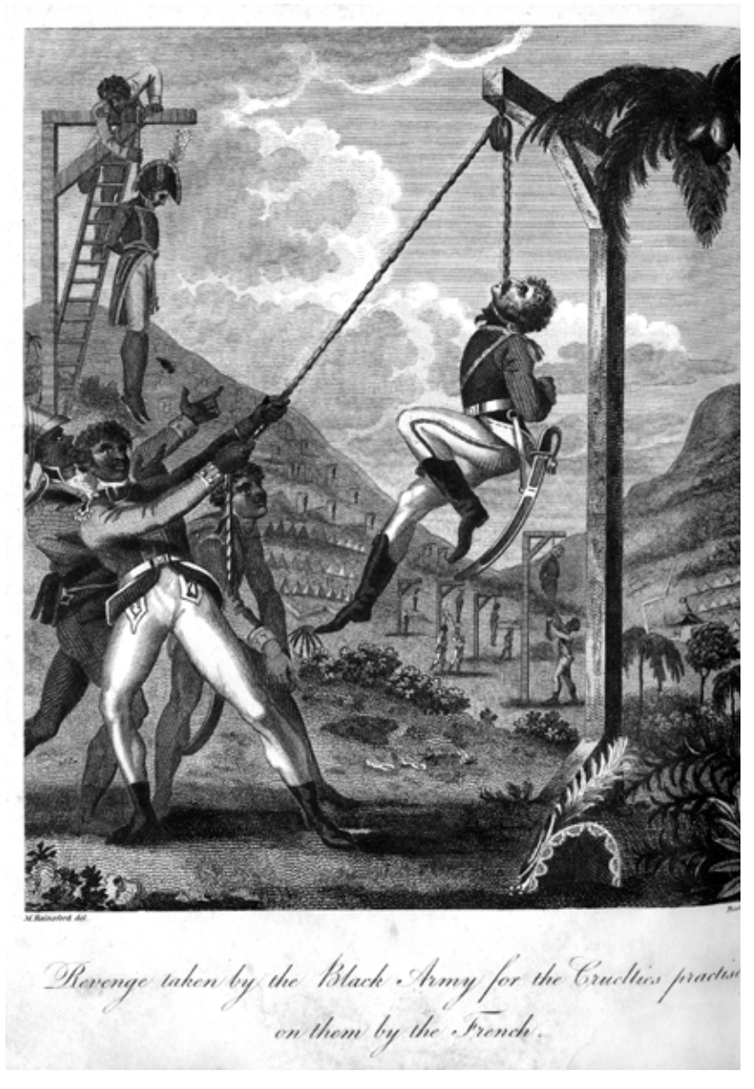
Figure 4. Engraving from Marcus Rainsford, The Black Empire of Hayti (1805).