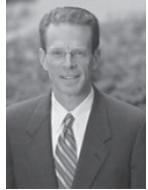
The Dean's Column

I had expected that the members of the faculty would be devoted teachers and accomplished scholars.