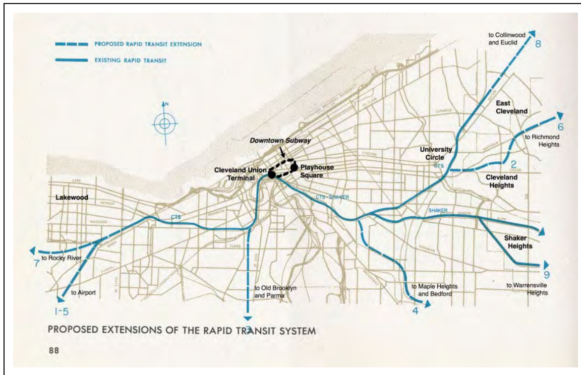
Figure 5. This map, modified from the original, depicts in bold lines the rapid transit system as it existed in 1955, including the Shaker Rapid (now known as the Green and Blue lines) and the new CTS Rapid (now known as the Red line) between West 117th Street and East Cleveland. The proposed downtown subway loop appears at center. The several rapid extensions plotted here with hashed lines would have served many of the outlying neighborhoods and suburbs where opposition to the subway plan was strongest.

The question of whether the rapid transit system could expand throughout the metropolitan area without a downtown subway to distribute the expected increase in passengers assumed clear class dimensions as the debate heated up. Originally billed as the hub of metropolitan transit, the subway took on a life of its own in the wake of the poor initial performance of the east–west rapid. In a special report to CTS in 1956, Charles DeLeuw recommended that no major new rapid extensions be built in the near term. 35 The main extensions, if built, would have expanded rapid transit service to the largely working-class suburbs of Brooklyn and Parma to the southwest, Garfield Heights and Maple Heights to the southeast, and Euclid to the northeast, all of which ultimately opposed a subway-first approach to transit modernization (see Figure 5).