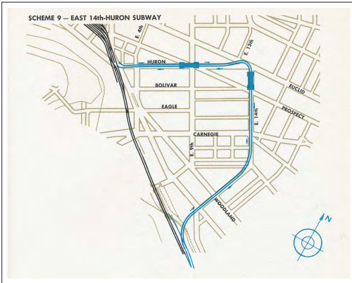
Figure 7. The East 14th–Huron Subway plan, a slightly modified update of the DeLeuw–Cather Hook, was considered on the eve of the first subway fight but abandoned because promoters understood that it would achieve a less robust distribution of riders throughout downtown Cleveland. When the City Planning Commission modified the plan in 1959 to run the subway under Euclid Avenue instead of Huron Road, it threatened to remove Higbee’s department store’s singular advantage—its entrance from the Terminal station—by creating a new station under Public Square. Source: Praeger-Kavanagh, Richard Hawley Cutting & Associates, and Charles E. DeLeuw, Cleveland Subway, Operating and Engineering Feasibility (Cleveland: Board of County Commissioners, Cuyahoga County, Ohio, 1955), 21.

was difficult to explain why fewer suburban housewives were engaging in the downtown shopping ritual. 93 Questioning downtown merchants’ claim that a subway would reduce street congestion, one downtown attorney argued that, apart from rush hour or the Christmas shopping frenzy, Euclid Avenue was if anything too sparsely populated with cars and pedestrians. “The trouble with Euclid Avenue,” he said, “is that it looks dead. You want people on Euclid Avenue and you are going to hide them down in this little tunnel.” 94 John Rohrich agreed. Speaking of a pro-subway editorial cartoon in the Cleveland Press cartoon showing a snarl of downtown traffic, he said, “There ain’t a person in this room [who] ever saw a jam of cars like they showed in that cartoon. . . . After 6:30 at night, you walk along Euclid, [and] you will hear the echo over in Jewish town [Glenville, a historically Jewish neighborhood five miles away].” 95 A commercial realtor concurred, arguing that the Terminal rapid station was nowhere near its capacity: “I could make up a ballgame in one corner and never hit anybody.” 96