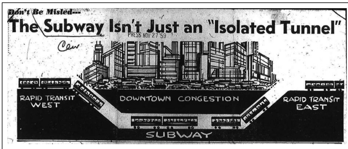
Figure 6. To counter opponents' charges that the downtown subway was an outrageously expensive and short tunnel, the Cleveland Press highlighted proponents' contention that the public should think of the subway as an integral hub in a long rapid-transit trunk line that in time would spur additional rapid transit lines reaching to every corner of the metropolitan area. Apart from the extension of the rapid to the city's airport in 1968 and the addition of the short Waterfront Line in the Flats entertainment district in 1996, however, the system remains the same nearly sixty years after the CTS Rapid opened.