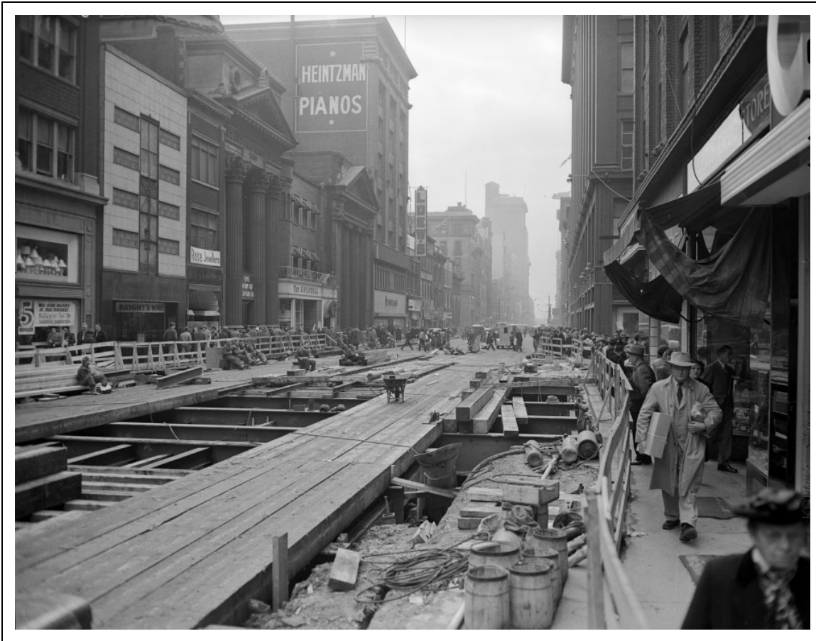
Figure 4. The Yonge Street Subway, shown here under construction on November 14, 1949, utilized the cut-and-cover method of construction, restoring vehicular and pedestrian access in segments. Charles E. DeLeuw, who also served as consulting engineer for the Toronto project, argued that Cleveland’s Euclid Avenue would remain open for business in spite of Albert S. Porter’s dire warnings of buildings collapsing into a morass of quicksand.