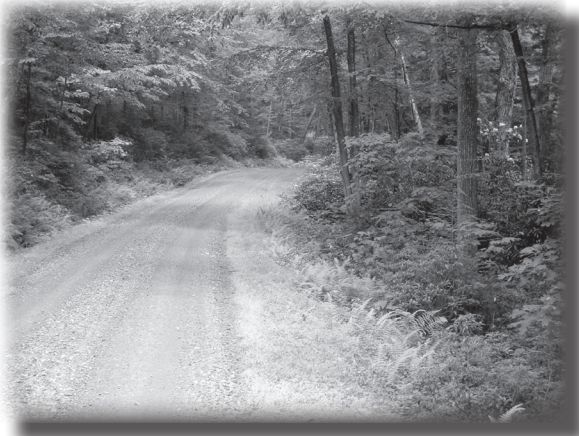
Stiltgrass is frequently seed in places like this roadside.

such as grading. The disturbance associated with building, using, and maintaining roads promotes the growth of invasives by breaking up the forest canopy to let in more light, as well as reducing competition