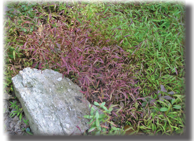
In the fall, stiltgrass turns a purplish-brown color before seed set

back the year after we spray glyphosate on a wetland plot. A bare patch of soil is vulnerable not only to erosion but to repeated invasion. We are increasingly convinced that any management plan has to weigh the immediate success of any management technique against future impacts. Currently there are no biocontrol agents available for stiltgrass. However in 2009 a fungal disease was found to be killing stiltgrass in Indiana and West Virginia. After more work, this may prove successful as a biological control.