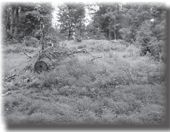
Logging sites are often later heavily infested by stiltgrass