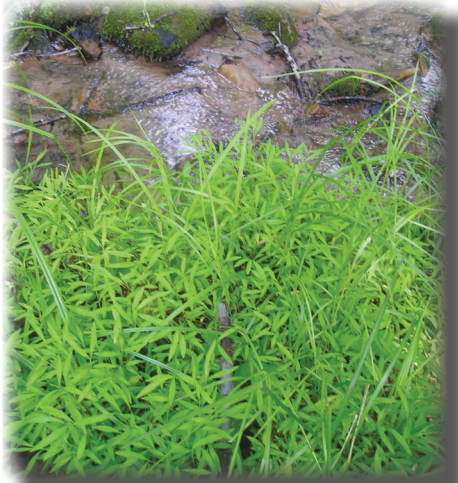
Stiltgrass can grow abundantly along streams

back the year after we spray glyphosate on a wetland plot. A bare patch of soil is vulnerable not only to erosion but to repeated invasion. We are increasingly convinced that any management plan has to weigh the immediate success of any management technique against future impacts. Currently there are no biocontrol agents available for stiltgrass. However in 2009 a fungal disease was found to be killing stiltgrass in Indiana and West Virginia. After more work, this may prove successful as a biological control.