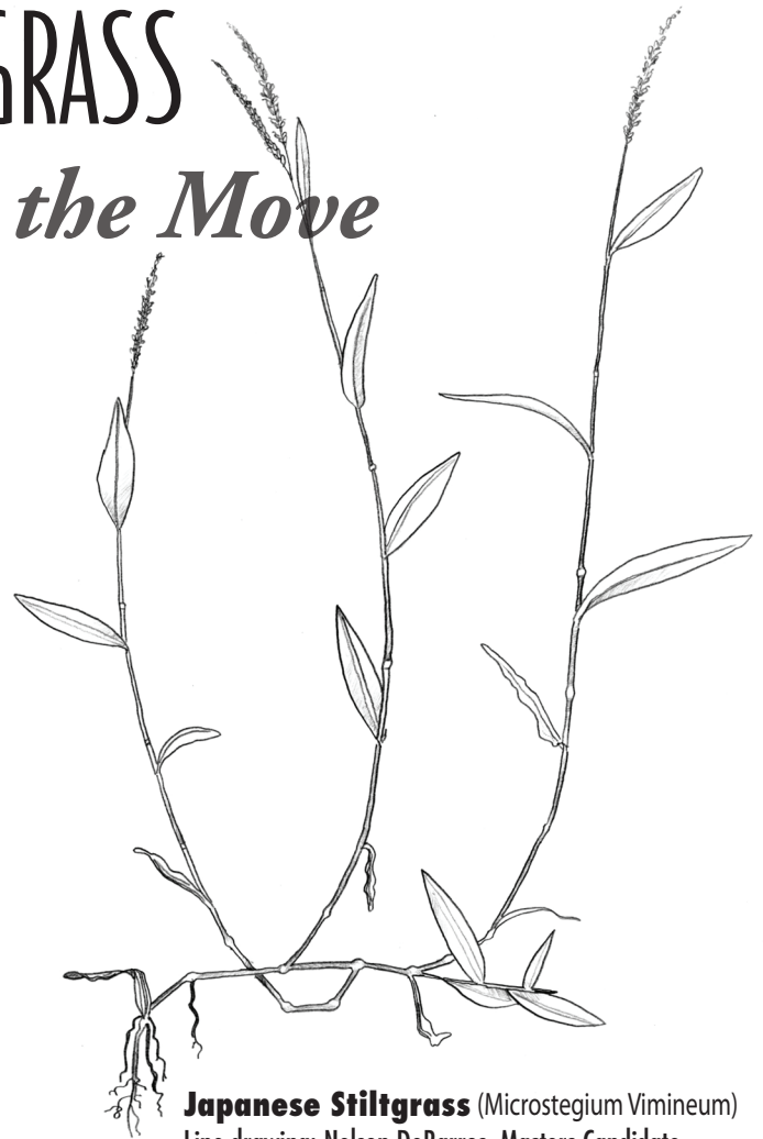
Japanese Stiltgrass ( Microstegium vimineum ) Line drawing: Nelson DeBarros, Masters Candidate, Dept. of Crop and Soil Sciences, The Pennsylvania State University

forest understory that it interferes with forest regeneration and reduces native plant diversity, and degrades habitat for declining species such as bog turtles and ground-nesting birds. Its impacts are felt below ground as well: its presence changes the characteristics of the soil, altering things like nutrient cycling,