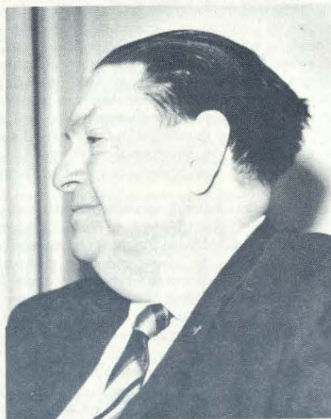
The Milhaud Society is grateful to have been given this picture of Darius Milhaud