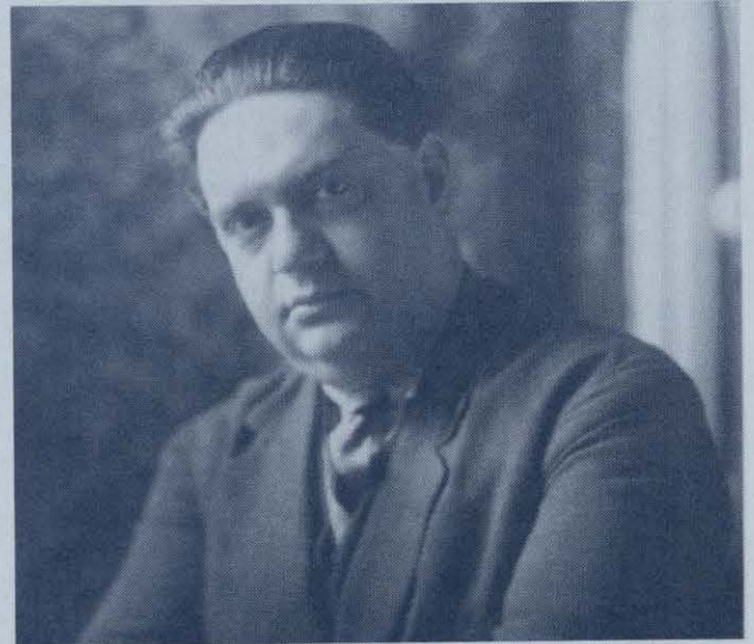
This picture of Milhaud as a young man is in the archives of the Bibliothèque Nationale in Paris. The photo is featured on the cover of the 3-CD Classical Collector (EPM 150 122). See p. 10.

For example, in the works of Darius Milhaud, probably the most important of our younger French composers, one is frequently impressed by the vastness of the composer's conceptions. This quality of Milhaud's music is far more individual than his use, so frequently commented upon, and often criticized, of polytonality. . . . If we consider broadly one of his larger works, the "Choéphores", we soon discover that on attaining the climax of a series of utterances tragic in character, in the course of which the most sweeping use is made of all the resources of musical composition, including polytonal writing, Milhaud nevertheless reaches still profounder depths of his own artistic consciousness in a scene where a strong pathetic psalmody is accompanied only by percussion. Here it is no longer polytonality which expresses Milhaud, and yet this is one of the pages where Milhaud most profoundly reveals himself. Of similar significance is the fact that in one of his latest works, Les Malheurs d'Orphée , in its recent American premiere at one of the New York concerts of Pro Musica, Milhaud's occasional use of polytonality is so intricately interwoven with lyric and poetic elements as to be scarcely distinguishable, while his acknowledged artistic personality reappears clothed with a certain clarity of melodic design altogether Gallic in character. . . .