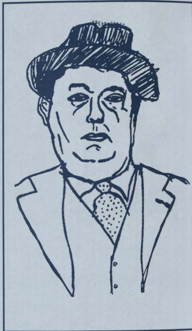
This self portrait, made by Milhaud in 1941, is in the archives of the New York Public Library. The drawing was published in the 1992 Aspen program book and in the Juilliard Journal of October 1992.

The hostile reactions did not impress Darius Milhaud, more determined than ever to follow his researches. Polytone and polyrhythm, aleatoric music ( Cocktail for voice and four clarinets), assimilation of Brazilian rhythms and of jazz, all of which allowed the musician to enrich his language, and especially gave him new means of expres-