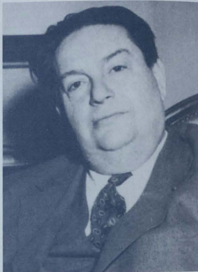
This Milhaud portrait graces the cover of the booklet enclosed in the CD of Pacem in terris.