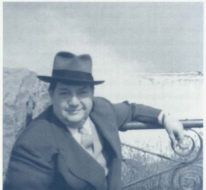
The pictures above were taken at Niagara Falls by Murray Adaskin. Mr. Adaskin kindly sent them to be added to the archives of the Darius Milhaud Society, for which the Society is very grateful.