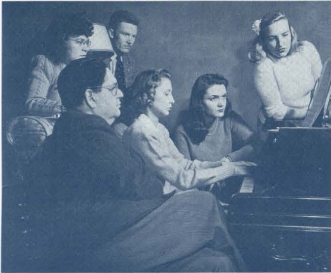
The picture above graces the cover of the booklet that accompanies the new CD recorded at Mills College in honor of the more than three decades that Milhaud served on the faculty there. The picture, made during the 1945-46 school year, shows Milhaud with some of his students at Mills.