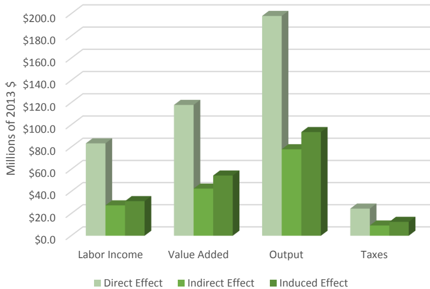
Figure 2: Labor Income, Value Added, Output and Tax Impact Measures for Northeast Ohio, 2014

There was $46.2 million in tax revenue associated with the activity of the companies in 2014. Of the tax impact, $24.5 million (53%) was attributed to direct impact, $9.2 million (20%) to indirect impact, and $12.5 (27%) to induced impact. Thirty-three percent ($15.2 million) of the tax impact was in state and local taxes and 67% ($31.0 million) of the tax impact was in federal taxes.