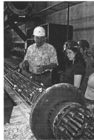
Fig. 2. Summer 1999 REU students tour Newmark prestressed spun concrete pole facility in Tuscaloosa, Ala.

an opportunity for students to ask questions about the Fundamentals of Engineering examination and Professional Engineer licensure),