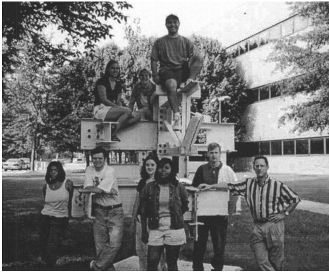
Fig. 1. Summer 1999 UAB REU program participants