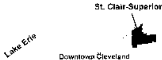
Figure 1 St. Clair-Superior Neighborhood, Cleveland, Ohio

identified the constituent parts of the inventory for the neighborhood: land use by focusing on vacant parcels and those with potential contamination from underground storage tanks (USTs) or past uses, and waterfront change, as well as facilities with Clean Air Act Title V permits to discharge into the air; facilities reporting to the Toxic Release Inventory (TRI); and facilities in the neighborhood storing or using hazardous materials. 11