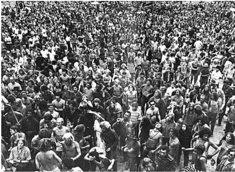
Figure 15: View from Vortex stage