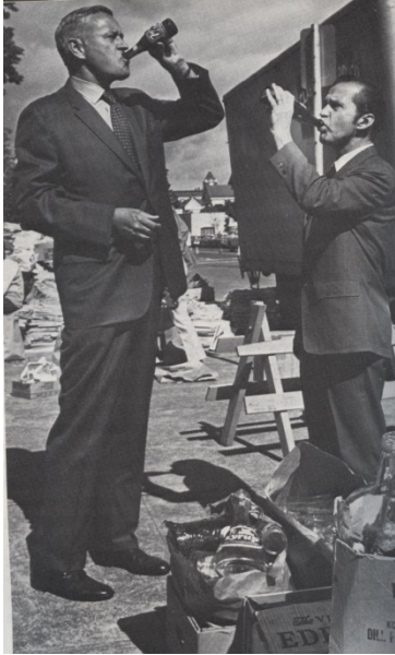
Figure 4: McCall working with secretary of state on bottle recycling law