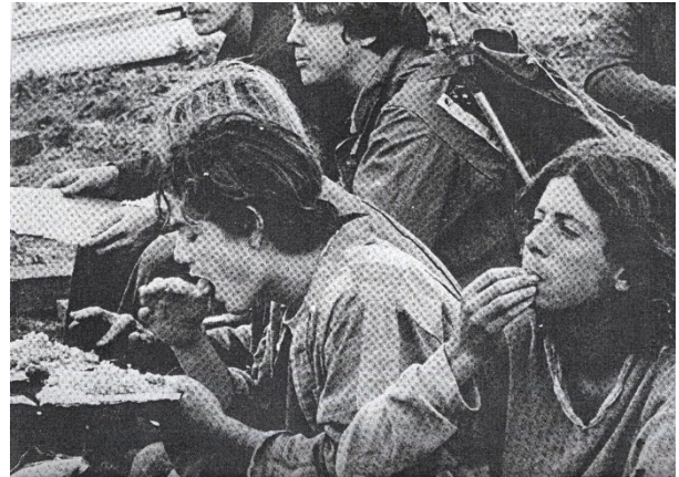
Figure 11: Concert attendees eat free rice with their hands