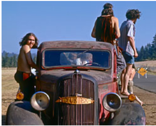
Figure 10: Youth heading to Vortex