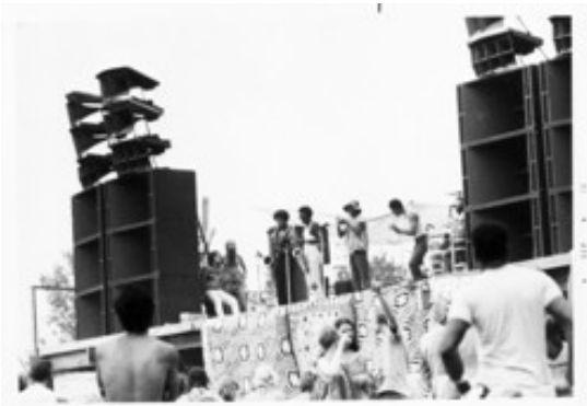
Figure 12: Vortex stage with performers