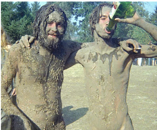
Figure 14: Friends after visiting the mud sauna at Vortex