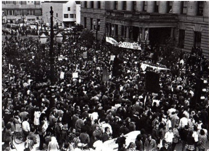
Figure 3: Portland citizens march to city hall to protest police violence