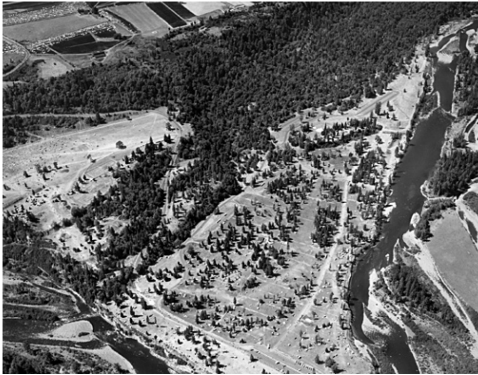
Figure 9: Ariel view of McIver Park shortly before Vortex