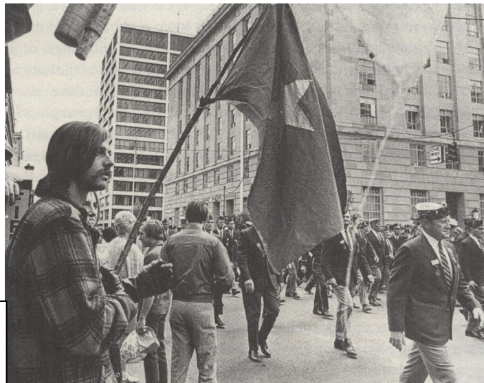
Figure 16: American Legion march; protestors on sidelines