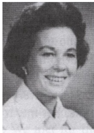
Figure 17: State Senator Betty Roberts