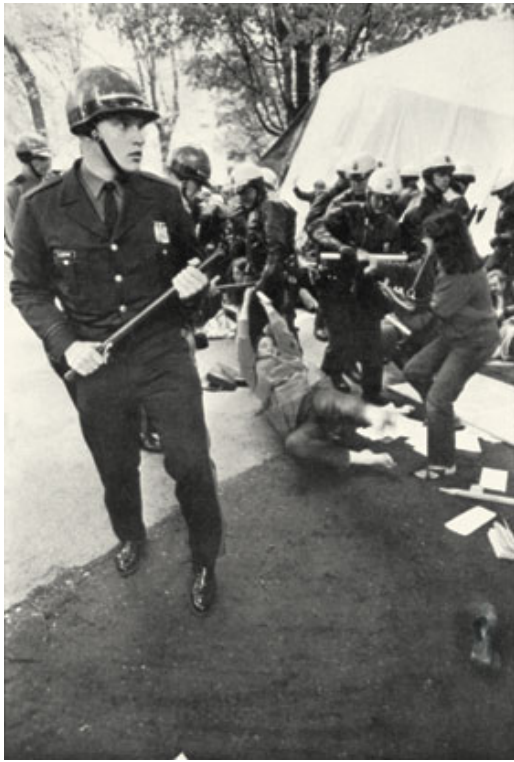
Figure 2: Police and students clash at PSU Campus, May 1970