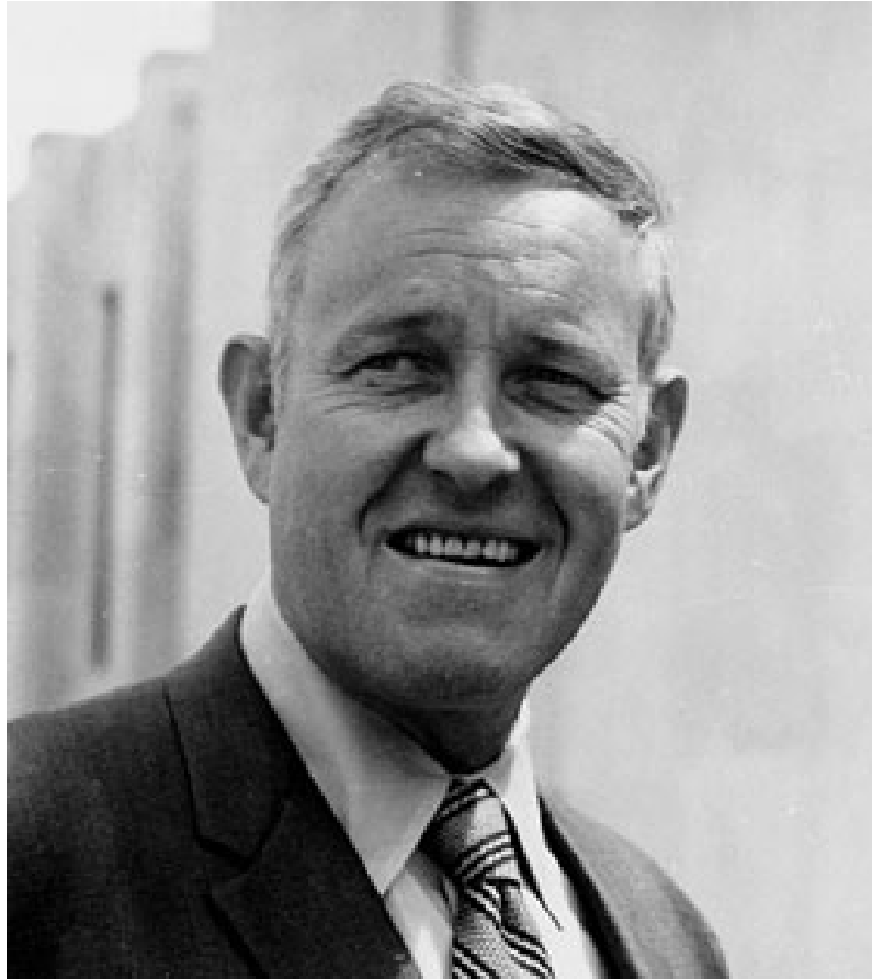
Figure 1: Oregon Governor Tom McCall