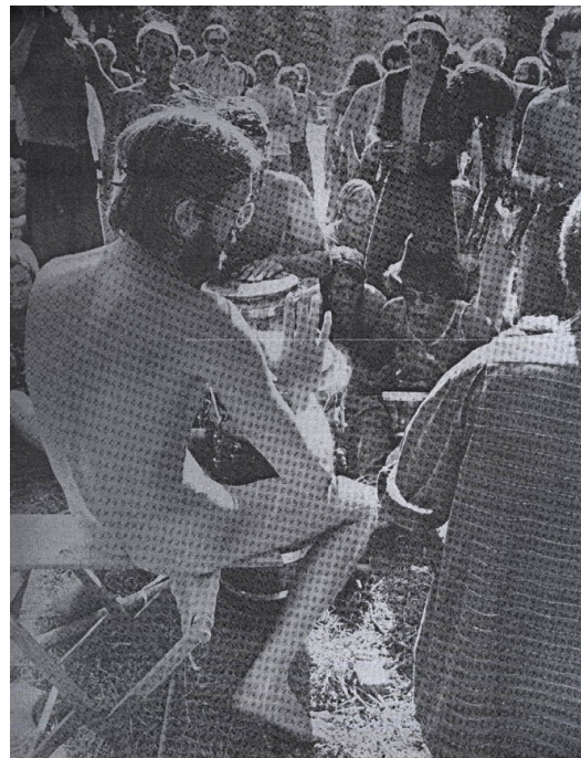
Figure 13: Vortex drummer