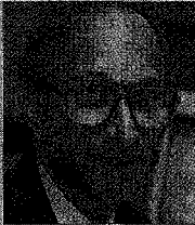
BY LLOYD B. SNYDER

Competent lawyers always research the views of