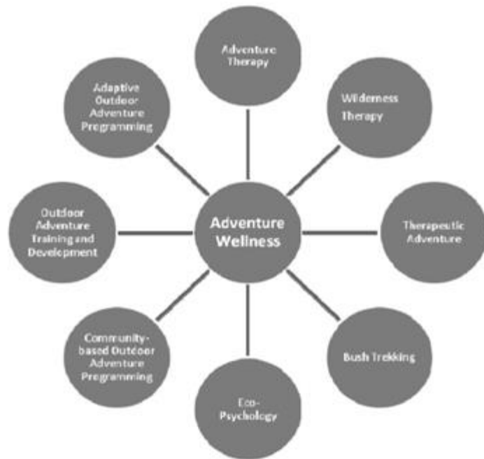
Figure 1: Itin & Mitten's (2006) Table of Adventure Wellness.

(Walsh & Golins, 1976), and provides opportunities to develop one's self-concept, behaviours and competencies. While the fundamentals of adventure may be misinterpreted by some, Ingman's (2017) eloquent passage about adventure alludes to its significance to those who have engaged in the practice: “...to Simon, adventure is the engagement in an authentic challenge removed from the constraints and responsibilities of society, often in partnership with a select few individuals, and these experiences are the very point and purpose of living in that they are memorable and meaningful” (p. 348).