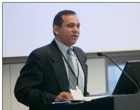
Dilip Ratha, World Bank

Fourth, developing countries should seek to train more people so as to offset the impacts of the brain drain. The diaspora can be leveraged for skill building and employment generation at home.