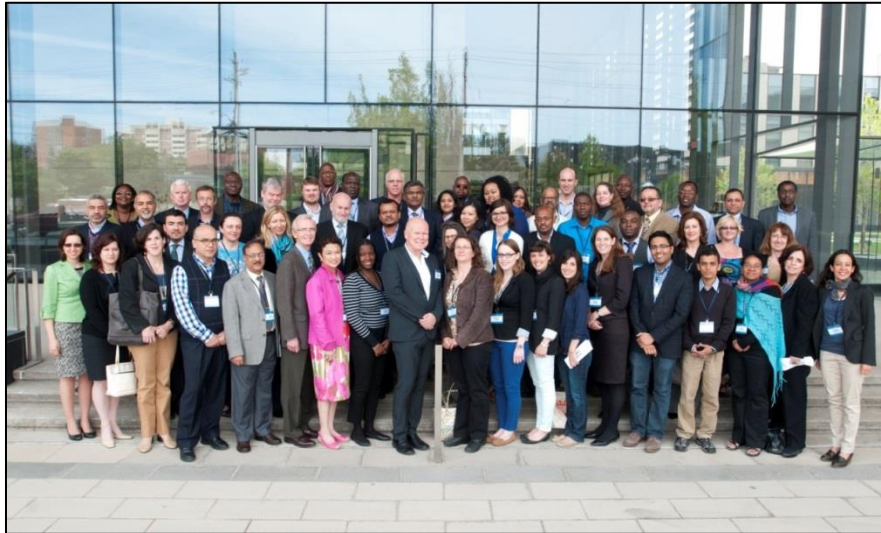
Participants at the Conference on Diasporas, Development and Governance in the Global South, held at the Balsillie School of International Affairs in Waterloo