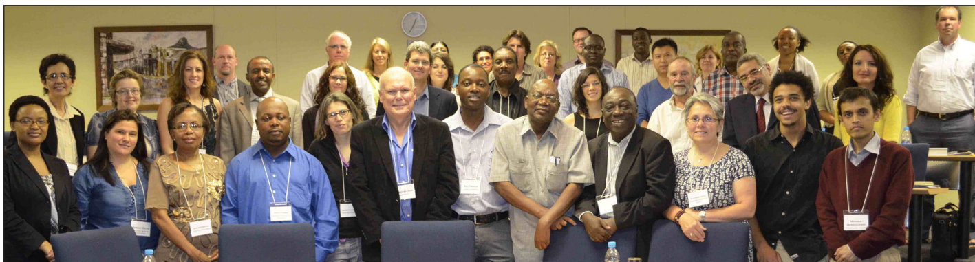
MEETING OF MINDS: Participants at the Cape Town, South Africa, conference on Migration, Urbanization and Food Security in Cities of the Global South.