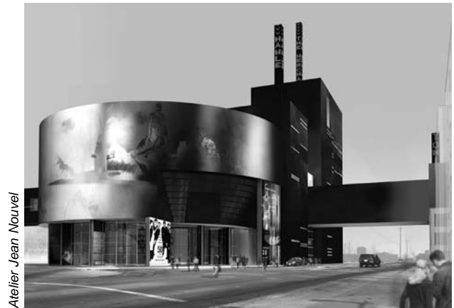
Atelier Jean Nouvel