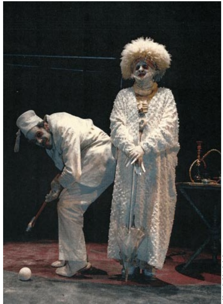
Figure 1: les vieux (the Old Couple) in Les Créations Diving Horse's production of Croisades .

However, the very idea of unity and universality which was at the heart of Vilar's theater would eventually be challenged during the second phase of decentralization beginning in the 1960s. Obviously, the use of such a concept as "universality" for the purposes of artistic representation is vulnerable to criticism. Roland Barthes, for example, questioned its value in his 1957 article, "The Great Family of Man," where he referred to the universalizing concept of "the human condition" as a "myth [that] rests on a very old mystification, which always consists in placing Nature at the bottom of History" (Barthes, 43). More specifically, his argument was that ideas of universality, in fact, conceal the historical nature of political and economic power relations, covering up the important details that expose