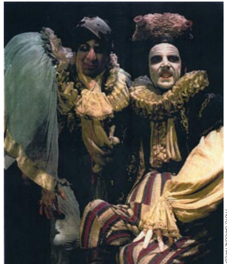
Figure 3: Burned Man and Red Man

Another example from the production that serves to illustrate some of the universalizing characteristics of la bouffonnerie includes the portrayal of the character "Maman Poule" (Figure 2). She appears androgynous in her curiously designed costume composed of a free-flowing, faded, rustic yellow gown, adorned with a large head-piece consisting of a metal plate topped with skeletal protrusions that extend nearly a foot into the air. Hanging from her neck are several layers of beads of various sizes and colors. Her face is covered entirely with a heavy, thick, white makeup that erases any trace of gender specificity. And in stark contrast to her all-encompassing white makeup is the painted-on, blood red mask that encircles her eyes. She carries with her a mummified doll wrapped in tattered cloth, and