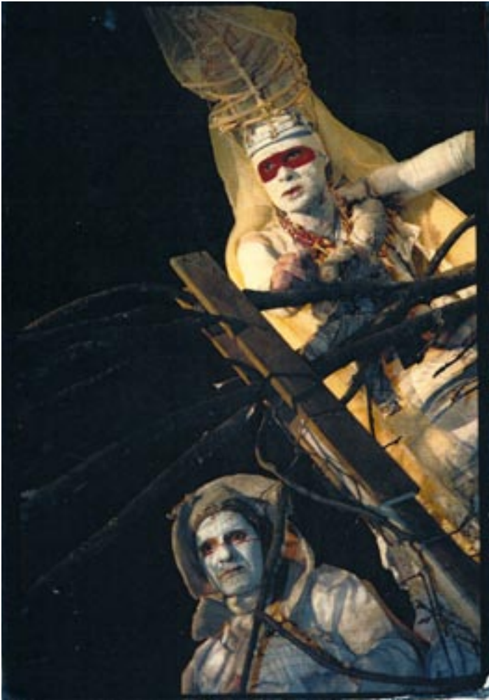
Figure 2: The androgynous Maman Poule.

By the 1960s, a new generation of theater artists had come to inherit the goals and, consequently, the contradictions of decentralization, and it is at this time that a new vision of the dramaturge developed. The création collective represented a renewed attempt to make theater pertinent to the working classes while at the same time equalizing its power dynamics by respecting the importance of all contributing theater practitioners (e.g., actors, directors, lighting designers, set designers). The director would no longer serve as dictator of the mise-en-scène , but rather every member would contribute equally, and, most importantly, be paid equally. But perhaps the most significant consequence of the création collective is that it diminished the traditional importance accorded to the playwright/ dramaturge , who had now been reduced to the role of a literary advisor to the collectively producing company.