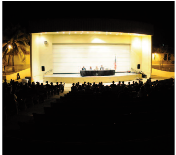
A staged reading on a large scale: A view from the back of the audience at the amphitheater in Guantanamo Bay, Cuba.

Selections from Philoctetes , the tale of an injured fighter abandoned by the Greek army, comprised the second half of the performance. First, Doerries explained Philoctetes's background. Before the Trojan War, he was a valuable asset to the Greek army because he knew the sea route to Troy. When bad winds forced the fleet to land and camp out on a little deserted island called Lemnos, Philoctetes suffered a poisonous snakebite at a shrine to the island's nymph. The resulting wound began festering, smelling foul, and causing Philoctetes great pain, and because it was caused by a supernatural creature, the bite would never heal. The annoyance of the stench and Philoctetes's persistent cries of agony drove the army to desert him on Lemnos, leaving him with only his special bow and arrows — gifts from Heracles that never miss their mark. At the beginning of Sophocles' play, the Trojan War is in its ninth year, so Philoctetes has been marooned for a long time. Betraying his own people, the Trojan seer Helenus has told the Greeks that Troy will never be captured unless Achilles' son Neoptolemus wields the bow of Heracles. Odysseus and Neoptolemus arrive on Lemnos with a plot to deceive Philoctetes into giving up the bow.