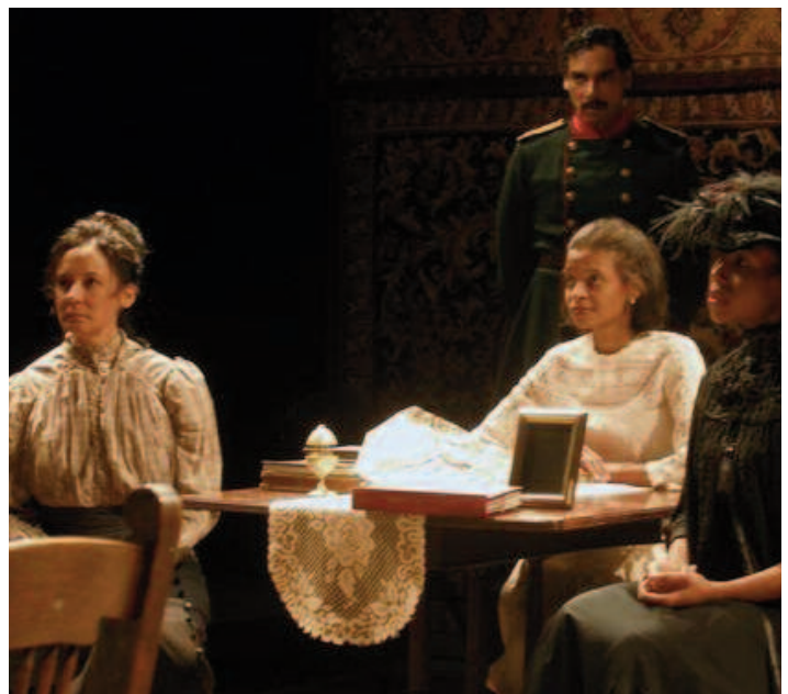
The Classic Theatre of Harlem production of Three Sisters .

Or maybe I have opened up future opportunities, such as the recent production of Measure for Measure that I worked on at the Oregon Shakespeare Festival. We have a white playwright, a white director, a Latino assistant director, a white dramaturg, two assistant dramaturgs (one African American and one Asian), and a white voice and text director, all working on a show that has been set in a Latino neighborhood in 1970s America. The Duke was played by a white actor and Isabella and Angelo were played by Latino actors. Was it strange to have a dramaturgical team that did not ethnically or racially represent anything related to the new setting for the play? Or was that inadequacy made up through the other members of the artistic team working on the show? Was having such an ethnically diverse cast and production team a formula for success or failure? What could I learn as an African American woman from transplanting Shakespeare's Jacobean Measure for Measure into a 1970s American setting? I think we all struggled with that question on a regular basis as we worked on this production. However, I can say that I did walk away with a broader Spanish vocabulary and more knowledge of Latino culture than I had walking into the rehearsal room.