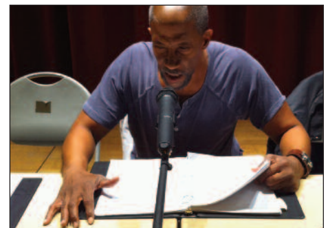
Theatre of War in performance.