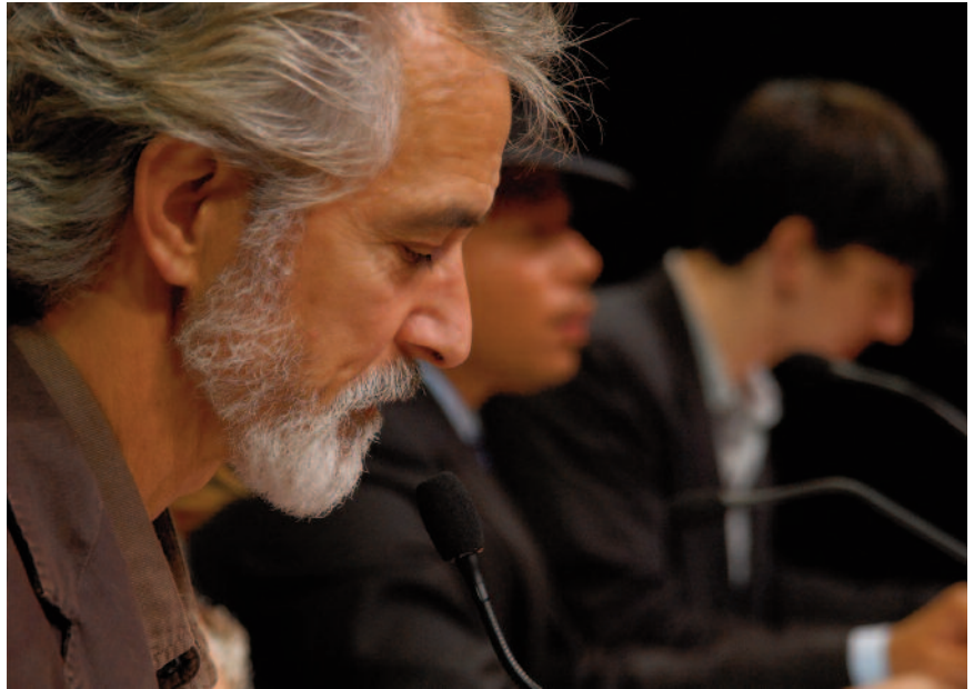
David Strathairn, Terrence Howard, and Adam Driver performing TOW at the Shakespeare Theater (Washington, DC).