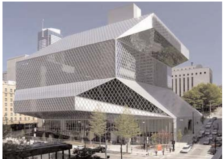
The new Seattle Public Library, designed by Rem Koolhaas.

Jen receives regional funds to address the intersection of poetry and performance with Caffeine Theatre, which locates the nexus of thought and action in language — specifically, in conversation. In order to expand this conversation beyond the borders of the stage, they want to stimulate talk and debate in the old coffeehouse style, an open forum for conversation, and a return to the radical tradition of poetry to pose questions of social conscience and of dramaturgical form.