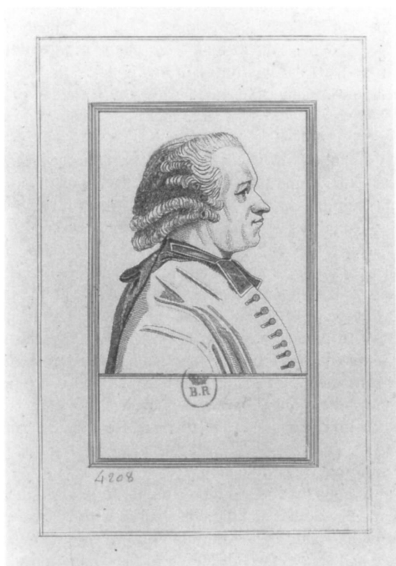
Figure 2. Jean-Louis Aubert, the editor of the Journal des Beaux-Arts et des Sciences during the Coultaud-Mercier affair.

Journal , and who was its editor? The life span of the Journal des Beaux-Arts et des Sciences nearly coincided with the Coultaud-Mercier controversy: the first number appeared in 1768 and the last in 1775. However, the Journal had considerably older roots. It was, in fact, the continuation of the Jesuit Journal de Trévoux , now in non-Jesuit hands.