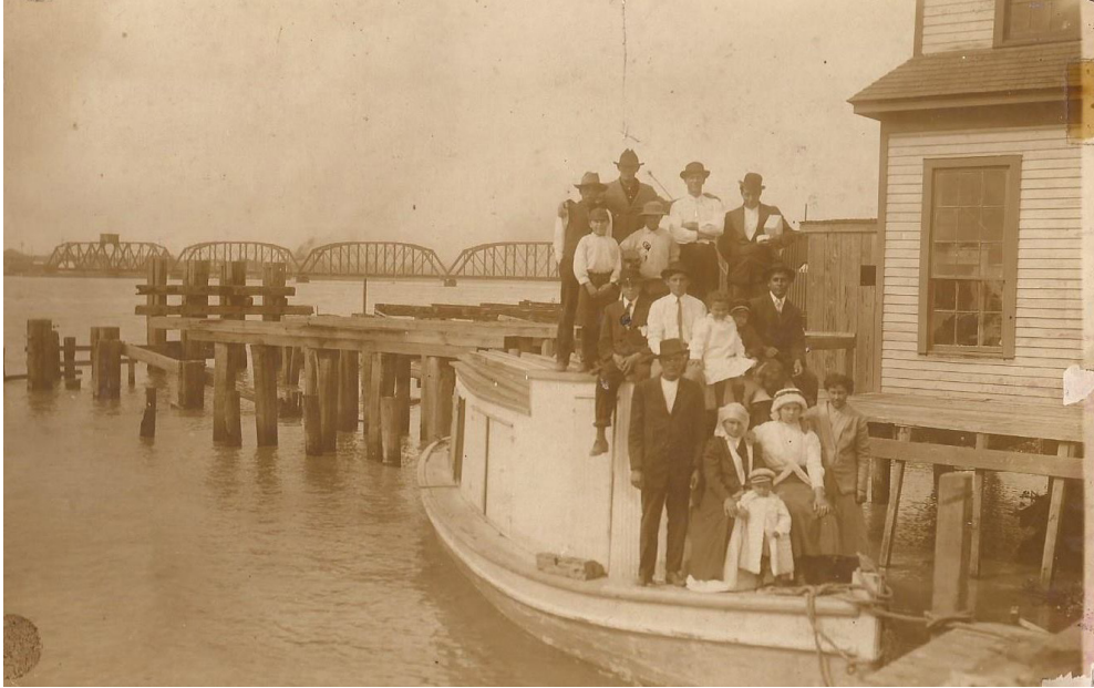
The Leco family's boat.

My grandparents were born and raised out there. That's how they were livin. My parents were part'a that too, but they started migrating "upfront." All you can see now of Manila Village is on your depth finder. You can see the water go from 5 feet...4...4...3...2...1. Then it's a circle in the water and they got some pickets there that's the only thing left. Over time, it just washed away.