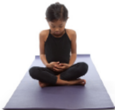
Balloon Breath 1