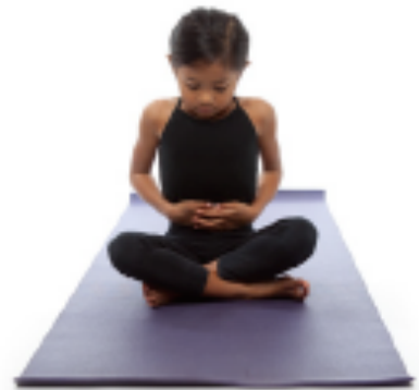
Balloon Breath 2