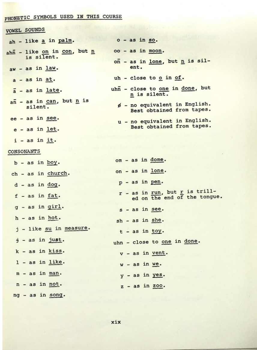
FIGURE 3. Excerpt from Faulk’s book Cajun French I. Faulk used English phonetics to explain pronunciation of vowel and consonant sounds in Cajun French.

adds. 82 Domengeaux was pitted against Faulk and, as a result, the public perceived him as “anti-Cajun.”