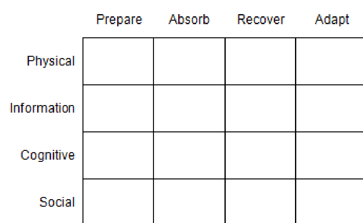
Figure 1. Resilience matrix framework of Linkov et al. (2013)

The Resilience Matrix (RM) is a framework for the performance assessment of integrated complex systems. The framework (Figure 1) consists of a 4x4 matrix where the rows describe the four general management domains of any complex system (physical, information, cognitive, social) as described in the US Army's Network-Centric Warfare doctrine (Alberts and Hayes 2003) and the columns describe the four stages of disaster management (plan/prepare, absorb/withstand, recover, adapt) as defined by the National Academy of Science in their definition of resilience (Committee on Increasing National Resilience to Hazards and Disasters 2012).