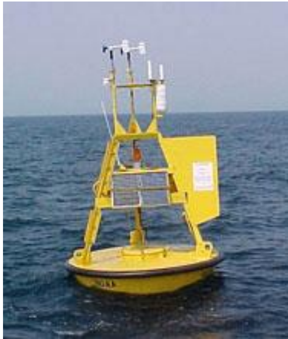
Figure 2. NDBC Station Number 42001. 3-meter discus buoy moored in the mid Gulf of Mexico, 180 nm south of Southwest Pass, LA at a depth of 3,365m. A maximum significant wave height of 9.25m was observed at 12:50 PM CST on September 8, 2008 during Hurricane IKE.

phenomena from waves, tides, and shallow water processes to climatic change. Wind waves also act to modify currents and atmospheric properties through frictional drag of near-surface winds and heat fluxes. Two-way coupled models allow the wave activity to feed back into the circulation and upon the atmosphere. An example U.S. Geological Survey project that is focused on understanding coastal erosion is the Coupled Ocean – Atmosphere – Wave – Sediment –