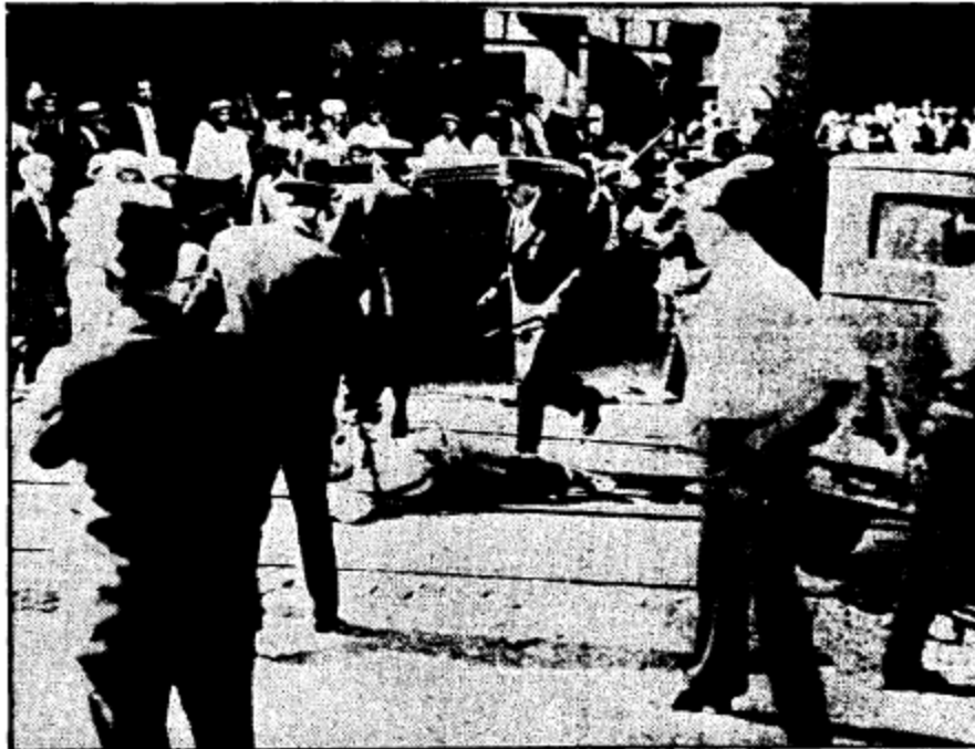
Policemen and strikers alike were clubbed down as riots continued in connection with the walkout of Minneapolis truck drivers. Above shows a truck driver who fell under an attack of police clubs. The toll of wounded in two days' battling stood at 56, with 36 of these injured during the renewal of fighting on May 21. Most of the hurt were strikers.

Minneapolis Police and the Citizens' Alliance at times overtly coordinated efforts to violently put down labor unrest through the strike. Their efforts were met with equal ferocity and determination on the part of labor. The caption reads,