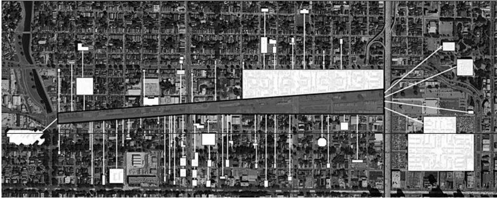
Student analysis of the large land use and activity centers that can generate use of the Lafitte Greenway in Mid-City and Tremé.

greenway project. University faculty and professional partners provided technical assistance, such as GIS mapping, demographic analysis, and grant writing, to support FOLC. Student work from the studio provided visual materials and maps that were adapted for outreach and advocacy efforts for both print and web-based publications (see http://www.folc-nola.org/ ). The success of this strategy has been carried through various stages of the project—including advocacy to ensure that the Lafitte Greenway would be included in each recovery plan. The partnership and FOLC made several grant applications totaling more than $400,000 in additional funding for planning, design development, or construction. 2