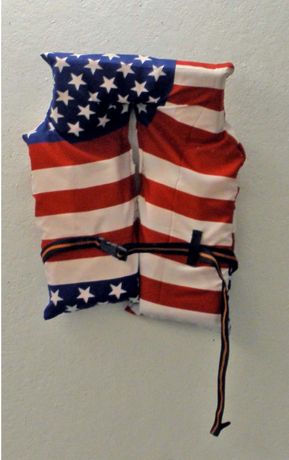
Plate 8. Bailout