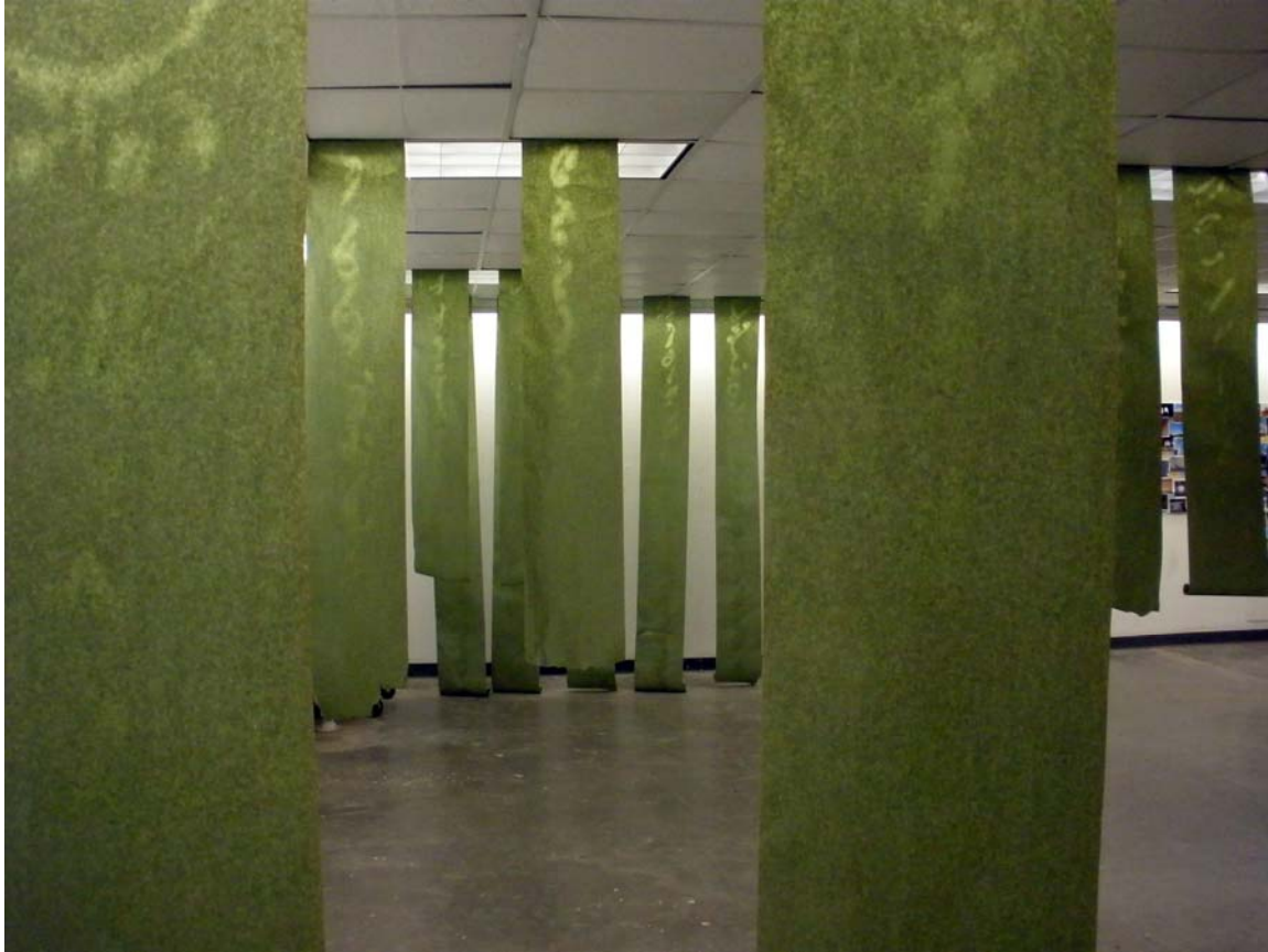
Plate 12. Shorthand

My most current work is comprised of multimedia paintings in which a word or phrase is the catalyst for all of the elements that make up the piece. Going back to “painting” after several years of creating sculpture and focusing on photography has proved a successful process.