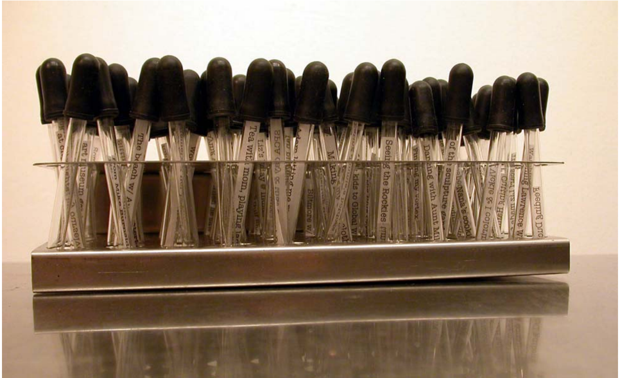
Plate 4. Positive Memories

The most recent work in “Preserved Memories” is I am... This piece comprises four round-bottomed glass beakers, precariously placed in a chrome condiment holder and placed on a stainless steel table. In each beaker are self-descriptions, four subjects in all.