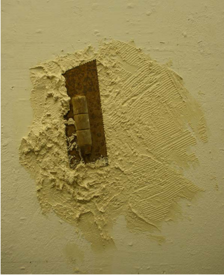
Plate 9. Abandoned