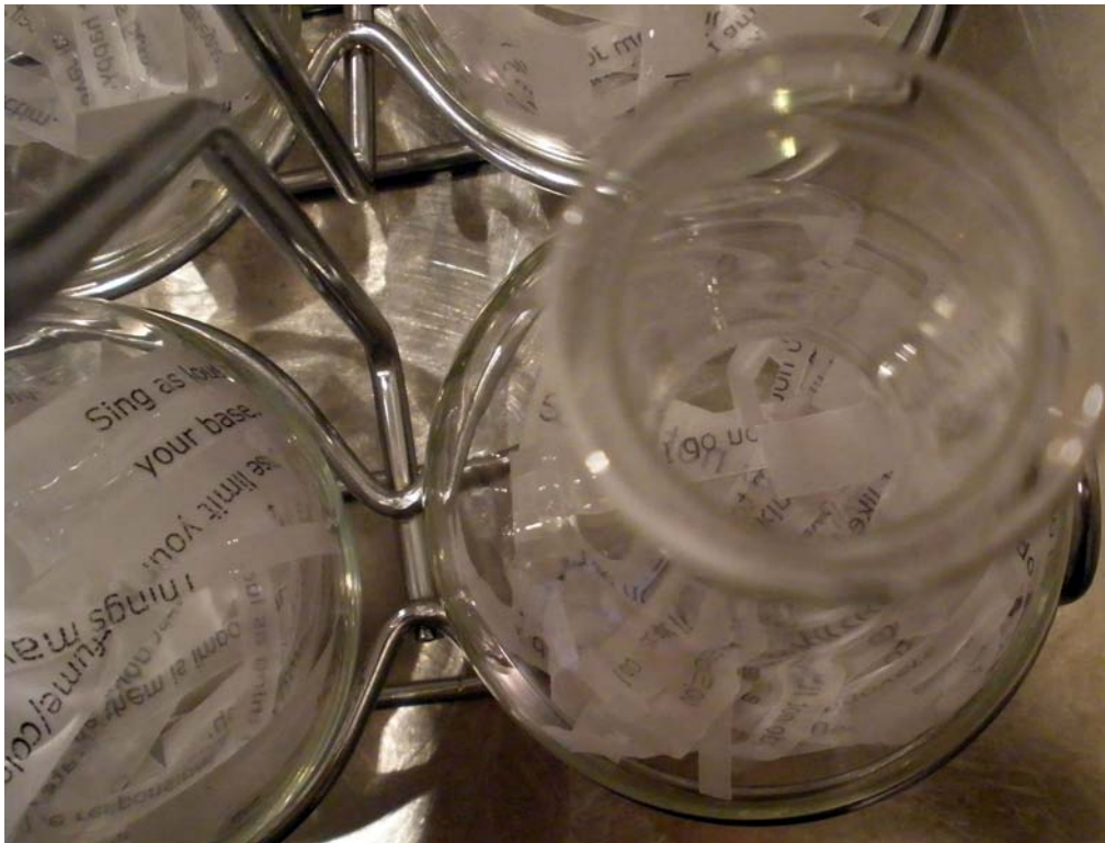
Plate 5. I am...

Art Speak says of narrative art: “The idea of narrative art can be art that represents events taking place over time or imply something that has already happened. Words are a frequent element in narrative art especially suited to a psychological self-examination.”