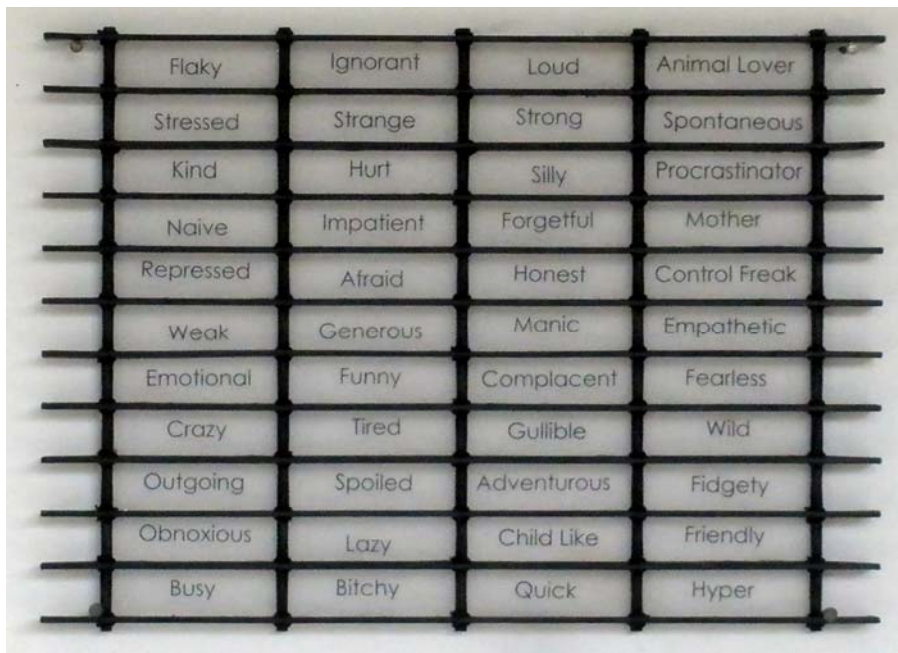
Plate 3. Defining Myself

Of all of the “Identity Crisis” series pieces I consider Defining Myself to be the most successful. This work is composed of a black floor grate in which each space is a word typed on vellum describing myself. The vellum and type are recurring elements in my work. Some of the words are brutal or self-effacing. The grate is hung slightly off of the wall so that light can come through the vellum, as it is a border between the artist and the viewer but slightly backlit to illuminate to the viewer who the artist is. Many can relate to the words as they may be used to describe others as well. Again there is a nice stark contrast of the black and white, no room for shades of gray here.