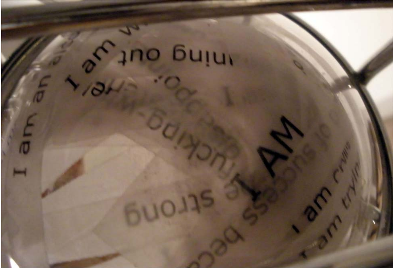
Plate 6. I am...