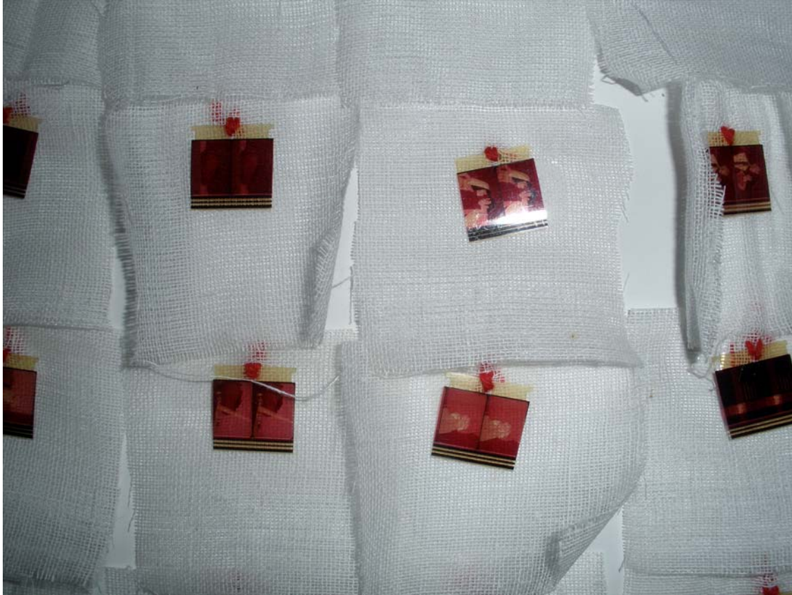
Plate 10. Edit

Although Edit is as yet incomplete I wish the end results to have the movement and presence of Dirty Laundry , an installation. Art Speak defines installation art as I see it.