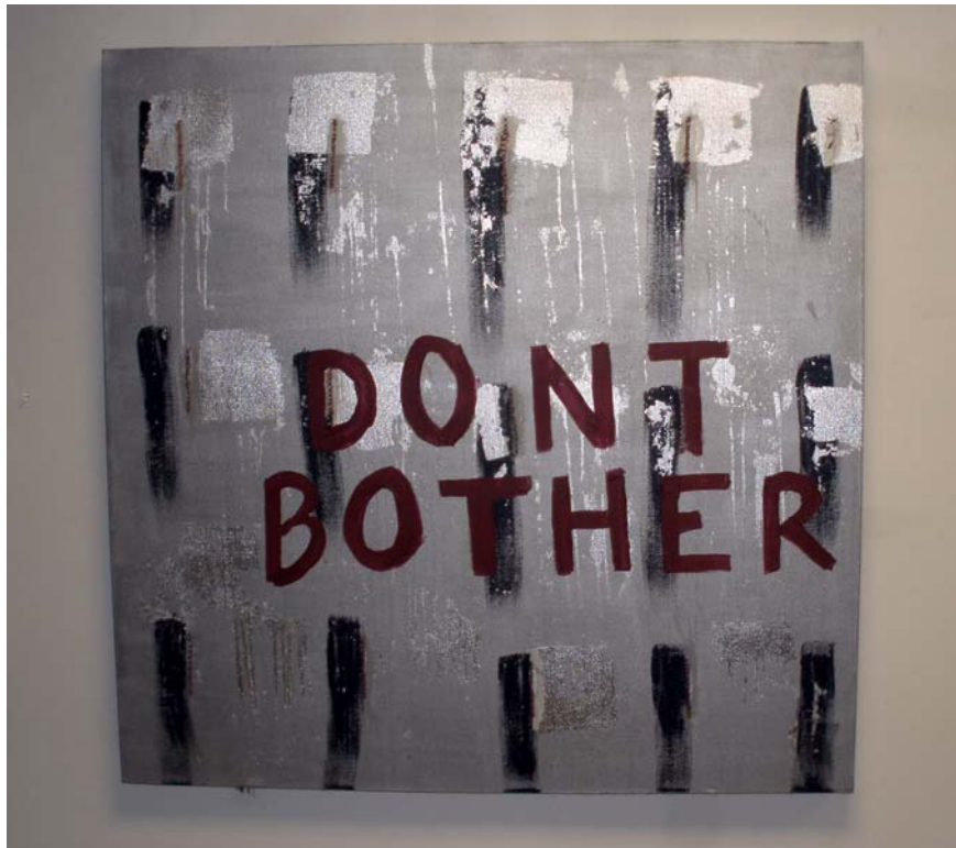
Plate 12. DONT BOTHER

An event happened that was the catalyst for what the painting was to become. I made slits in the canvas and sewed them back together with red thread in an “x” pattern. This emulated stitches and the healing process from deep wounds. As in the past I used wax to seal these stitches and ensure they would remain emotionally intact and closed. The final act for this painting was the text. DONT BOTHER was painted across the canvas with dark red iridescent paint. This statement was from an emotionally raw place and the formalizing of it in a painting was insurance from feeling hurt again. The subsequent paintings repeat the grid, experimentation with materials and are titled HOW DARE YOU , LET IT GO and LEAVE ME ALONE .