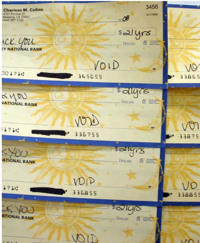
Plate 1. Untitled (Void)