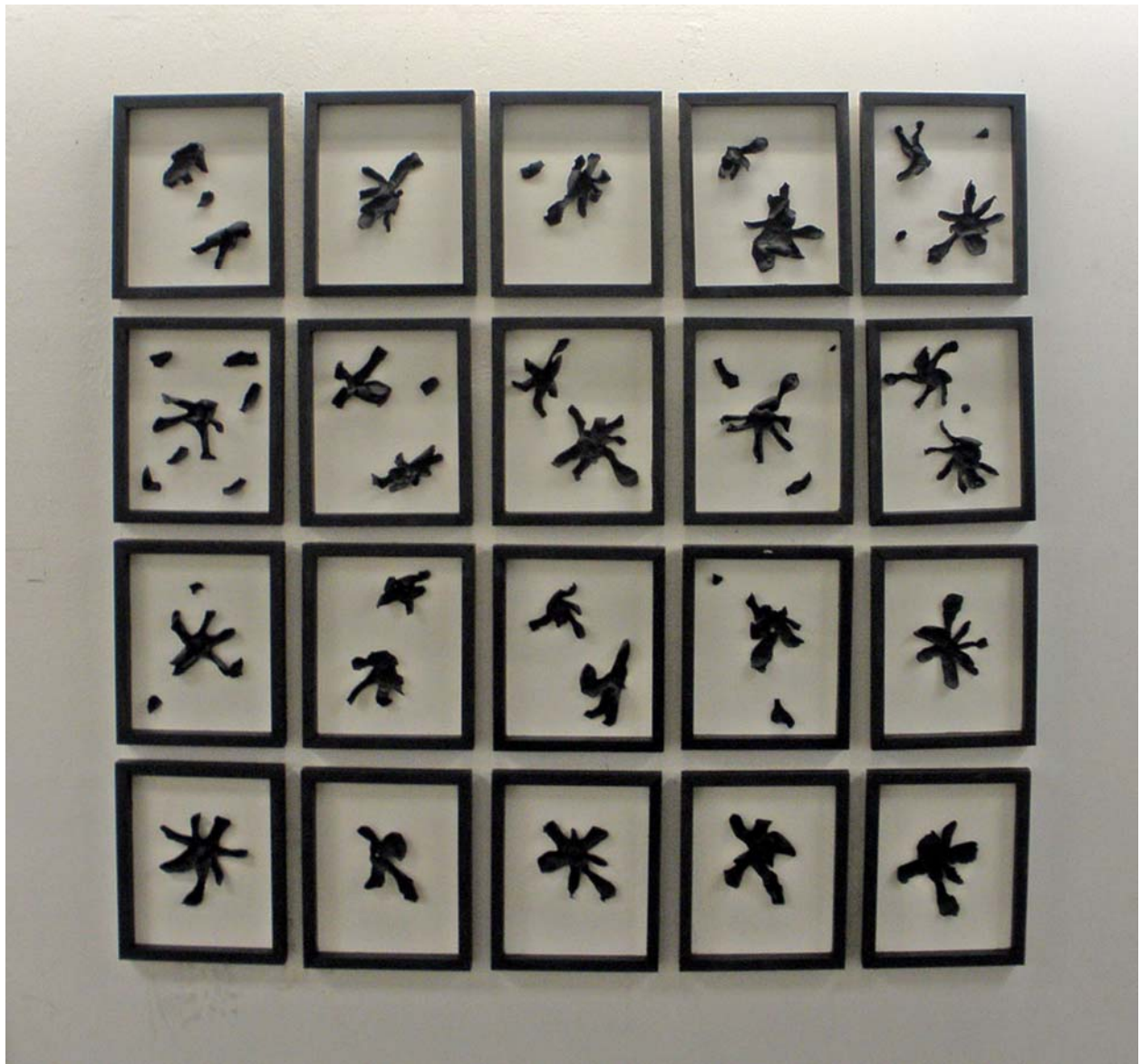
Plate 2. Skewed Rorschach