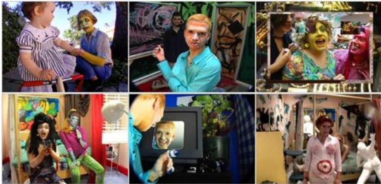
Fig. 1 Ryan Trecartin, video stills from, I-Be Area , 2007

issue. Gioni uses the multilayered complexity of Ryan Trecartin's video art (fig. 1), and the work of the artist's peers, as a reference. According to Gioni, the distinctly contemporary theatrics in the artist's work, "is a reflection of the world they have inherited, drowning in information and images. It's as if information is speaking the characters rather than the other way around." 2