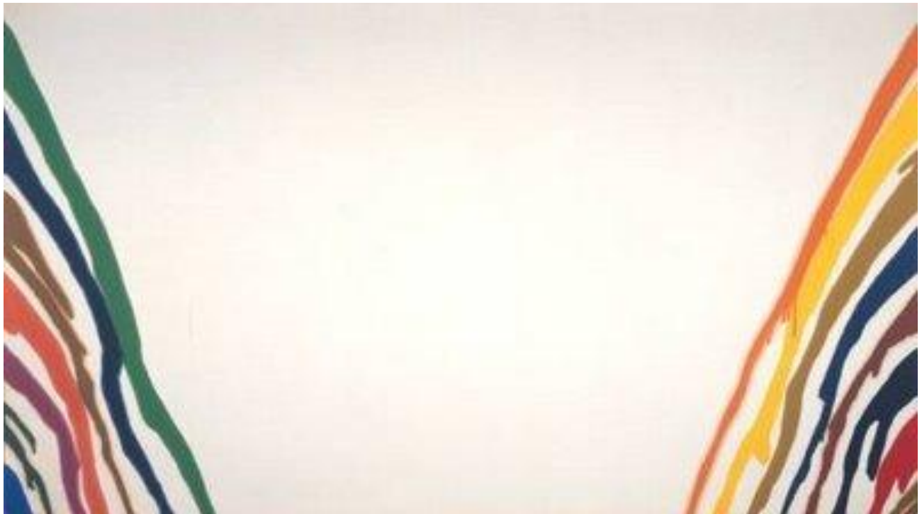
Fig. 5 Morris Louis Alpha-Phi , from the Unfurled Series , Acrylic on canvas, 1961, 180 x 102 in.

or range of hills that divides the land. Whatever the scenario, the vibrating energy of these bands suggests this path continues infinitely. I am inspired how the non-representational blankness of these stripes actually creates more potential narratives in The Road to Decoration City , than if the bands of color contained additional realistic information. Had these stripes exhibited representational details, such as trees or cars, viewers would be influenced by these clues. This audience would have restricted space on which to project varied narratives. Rather than simply exist an empty space, the abstract forms of The Road to Decoration City are fundamental to the work's sense of mystery and fantasy.