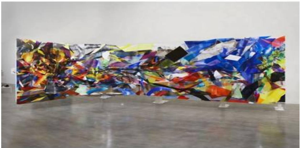
Fig. 3 Kristin Baker, Flying Curve, Differential Manifold , acrylic on acrylic with powder coated steel freestanding structure, 2007, 96 x 360 in.

seductive, faceted feeling, a major part of its negative emotions comes from viewers' potentially inconsonant feelings regarding expressive painting. Due to the negative opinions attached to two of the most crucial recent expressive painting movements, Abstract Expressionism and Neo-Expressionism, an audience may be surprised to see a contemporary painting that is both successful and relevant, and fearlessly demonstrates an expressive style.