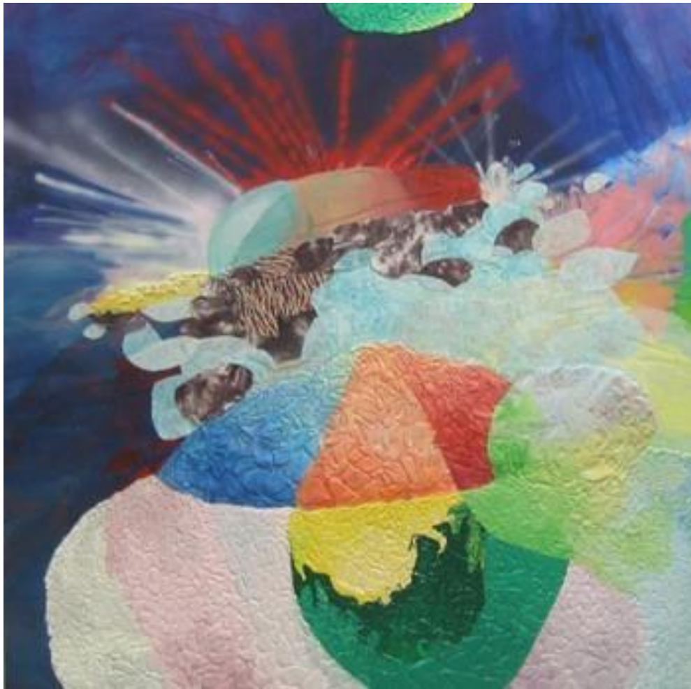
Fig. 4 Jessica Bizer, Love is a Serious Business , acrylic, fabric and foam on canvas, 2008, 50 x 50 in.

gas or liquid. Additionally, the red and white blast could represent a massive explosion occurring in the distance or directly on top of the fabric. It is also possible to imagine the oval-shaped material as a source of energy for this explosion. Or, this fabric could represent a horizon that is completely separate from the blast. The slope of this activity suggests even more possibilities for the work. For instance, viewers may believe these angled images are a fantastical landslide or avalanche, occurring either on top of, or behind the red, orange and blue collage material.