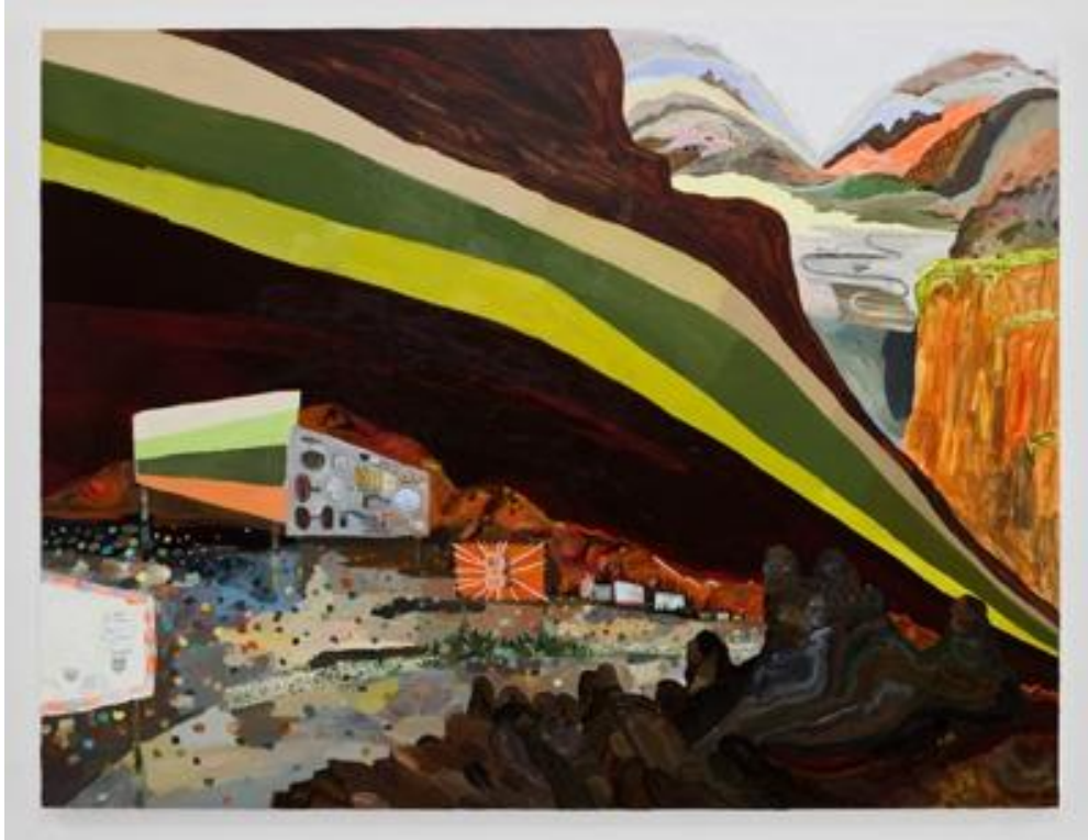
Fig. 6 Lisa Sanditz, The Road to Decoration City , acrylic on linen, 2008, 67 X 86 5/8 in.