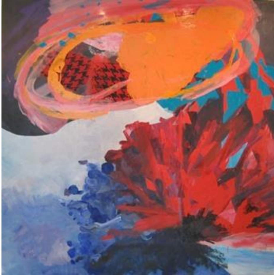
Fig. 2 Jessica Bizer. That Was the Weird Part , acrylic and mixed media on canvas, 2009, 80 x 80 in.

The activity created by the orange loops of paint and black and red fabric at the top-right composed of celebratory, optimistic colors and attractive smooth textures. My goal is for the whirlwind's overall energy to be positive, but slightly disordered. This area of the canvas receives some additional chaotic sensations from the squares of hounds-tooth fabric, located towards the bottom-left of the orange loop. These patches of fabric are formally incongruous with the brushstrokes and are in danger of existing only as superfluous collage material. However, I intend for the fabric's specific angle to contribute to the whirlwind's outward energy. Additionally, the red paint stained on the squares' left edges convincingly, if tenuously, integrates the pattern into this area.